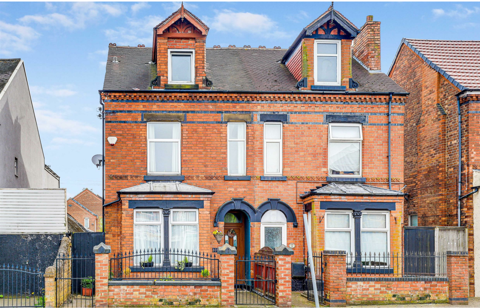
Carlton Hill, Carlton, Nottinghamshire NG4 IGL