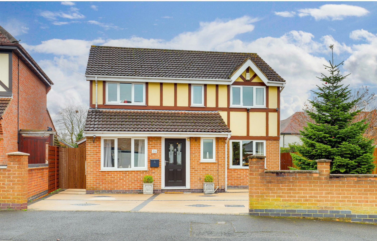
Sutherland Road, Nottingham, Nottinghamshire NG3 7AP