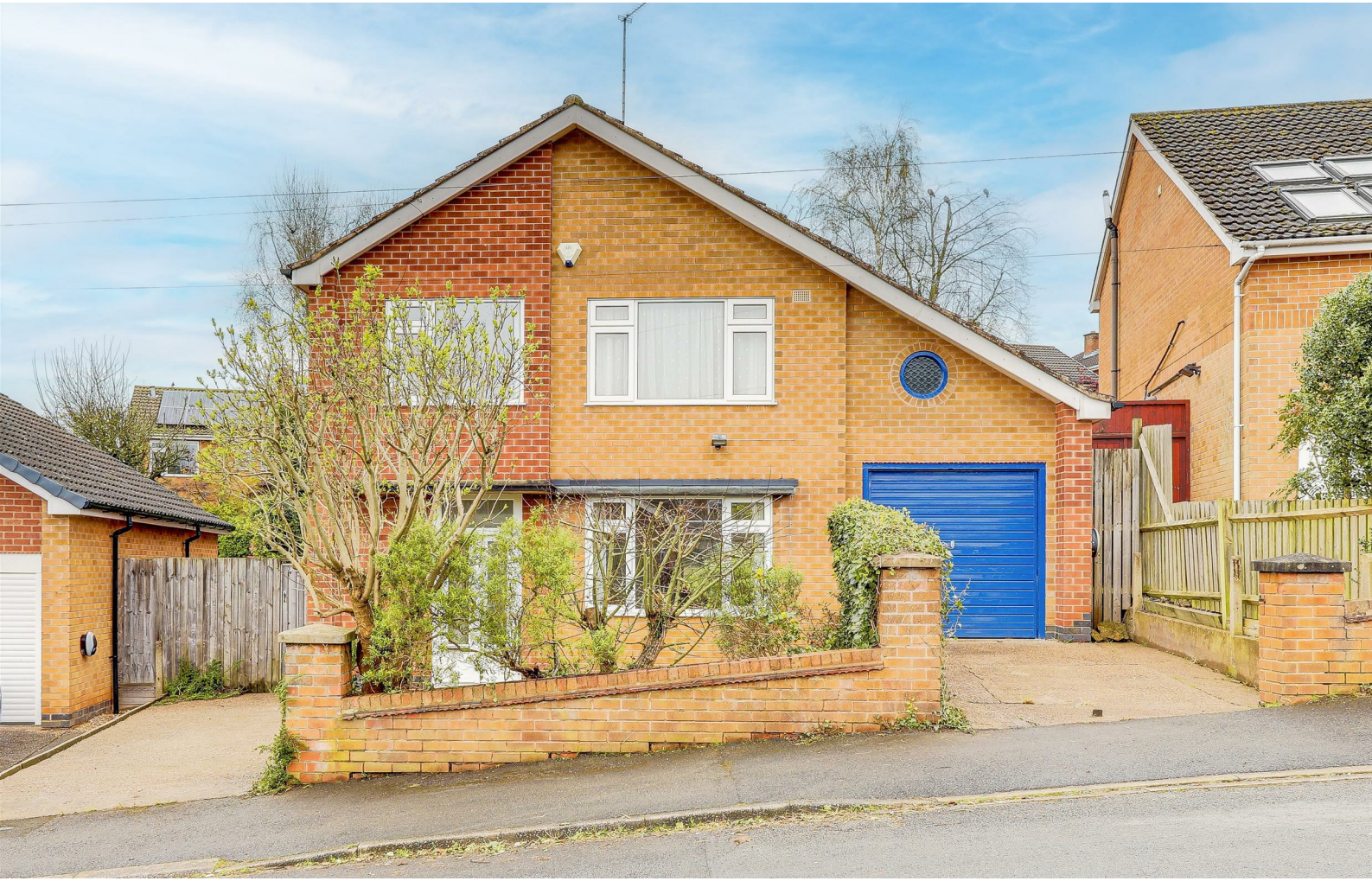
Longacre, Woodthorpe, Nottinghamshire NG5 4JS