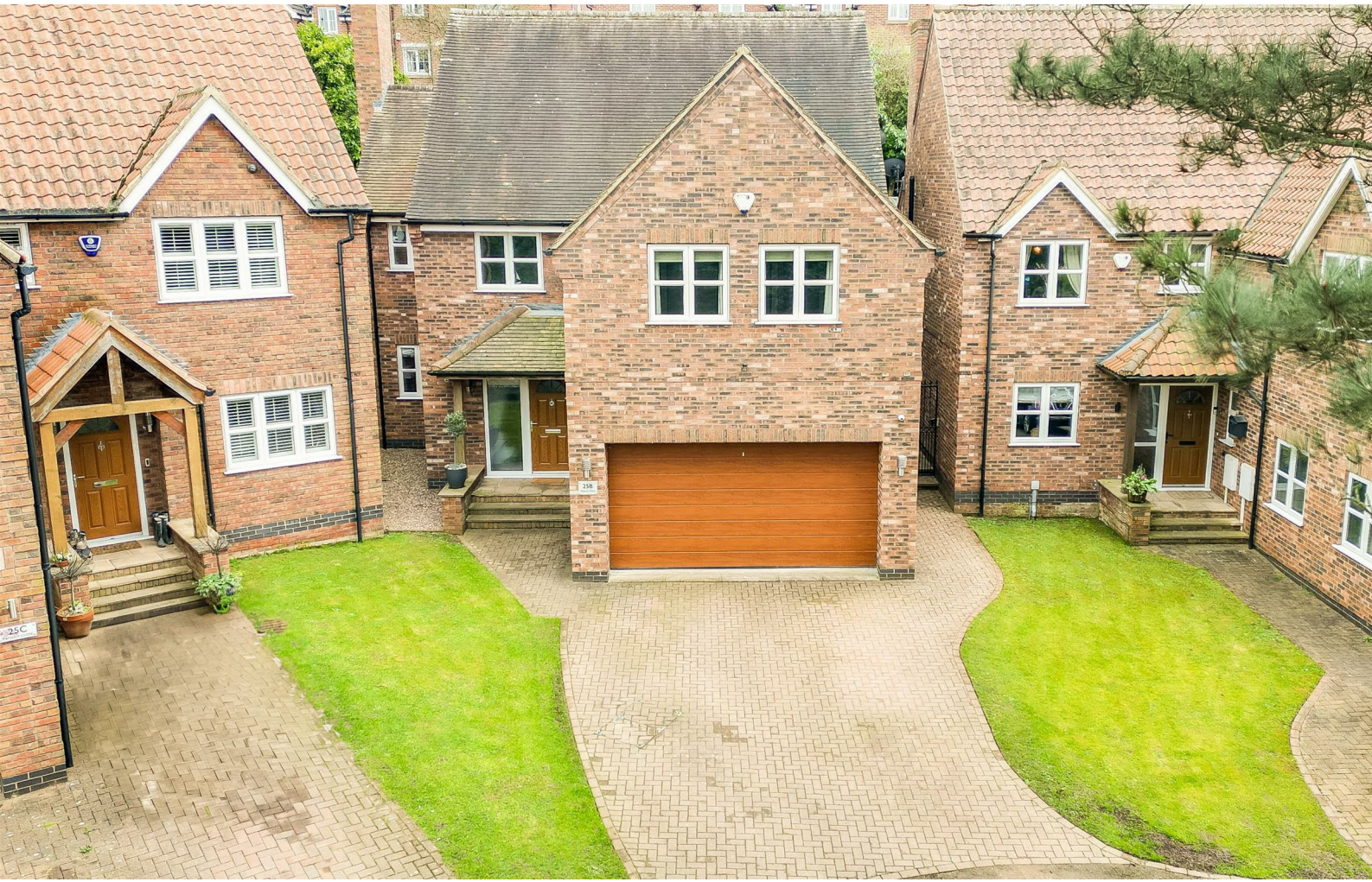
Tamarix Close, Gedling, Nottinghamshire NG4 4AJ