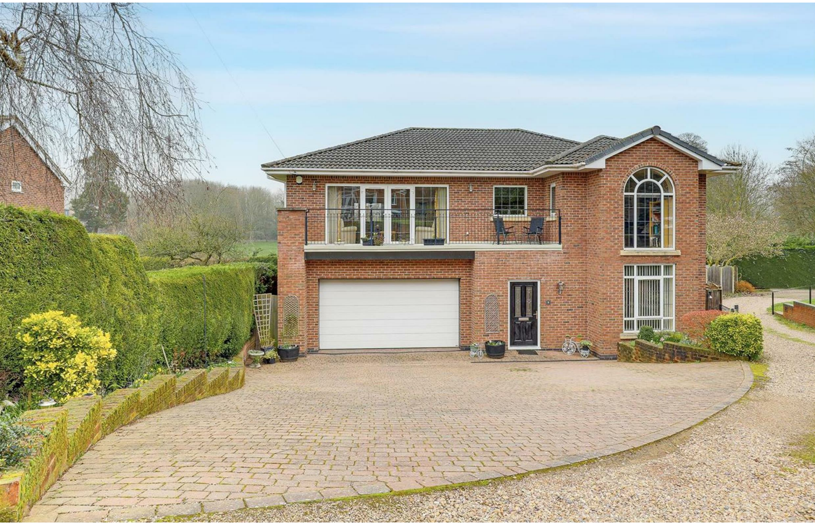
Field Close, Gedling, Nottinghamshire NG4 4DE