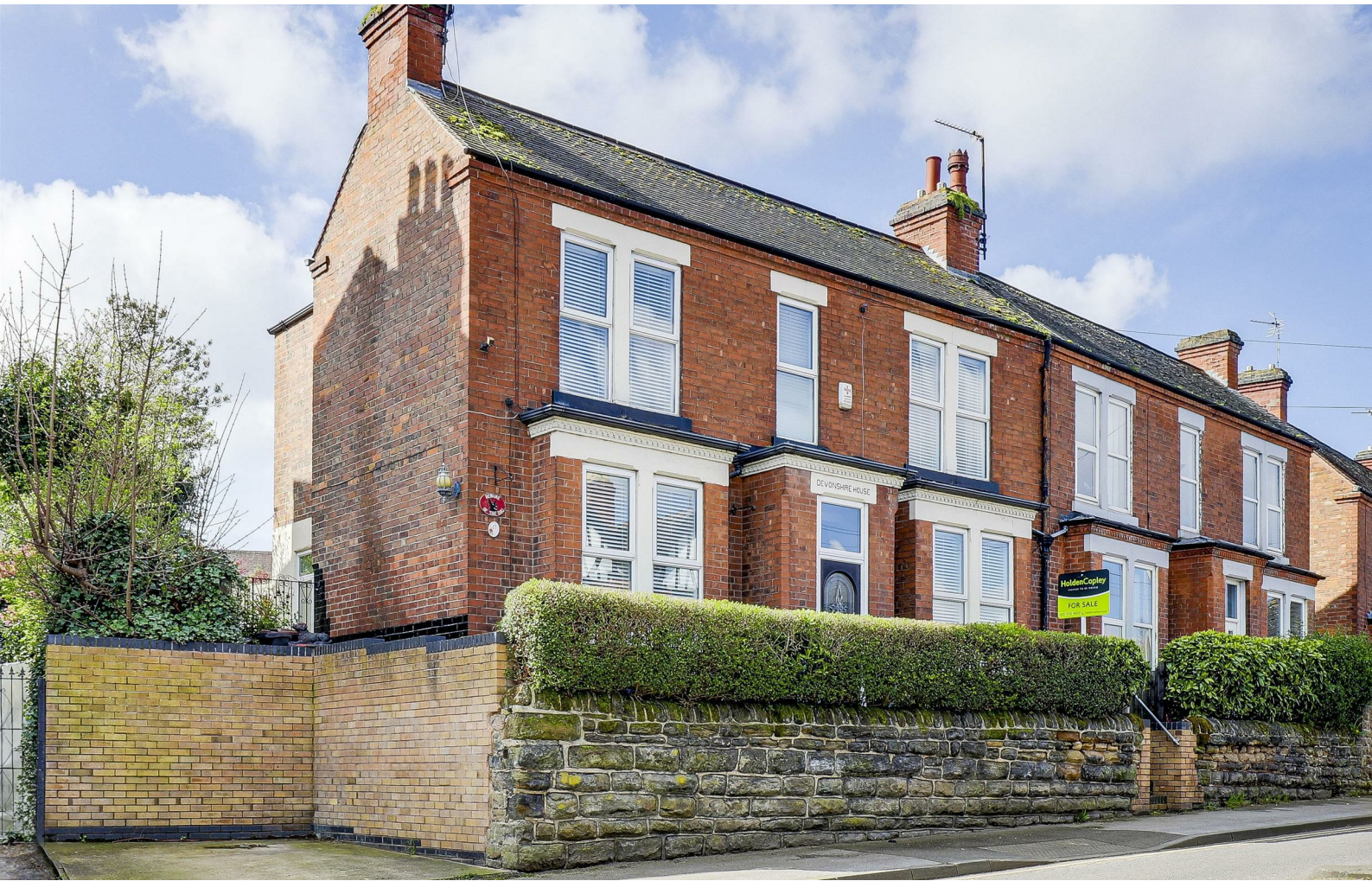
Devonshire House, Station Road, Carlton, Nottingham, NG4 3AT