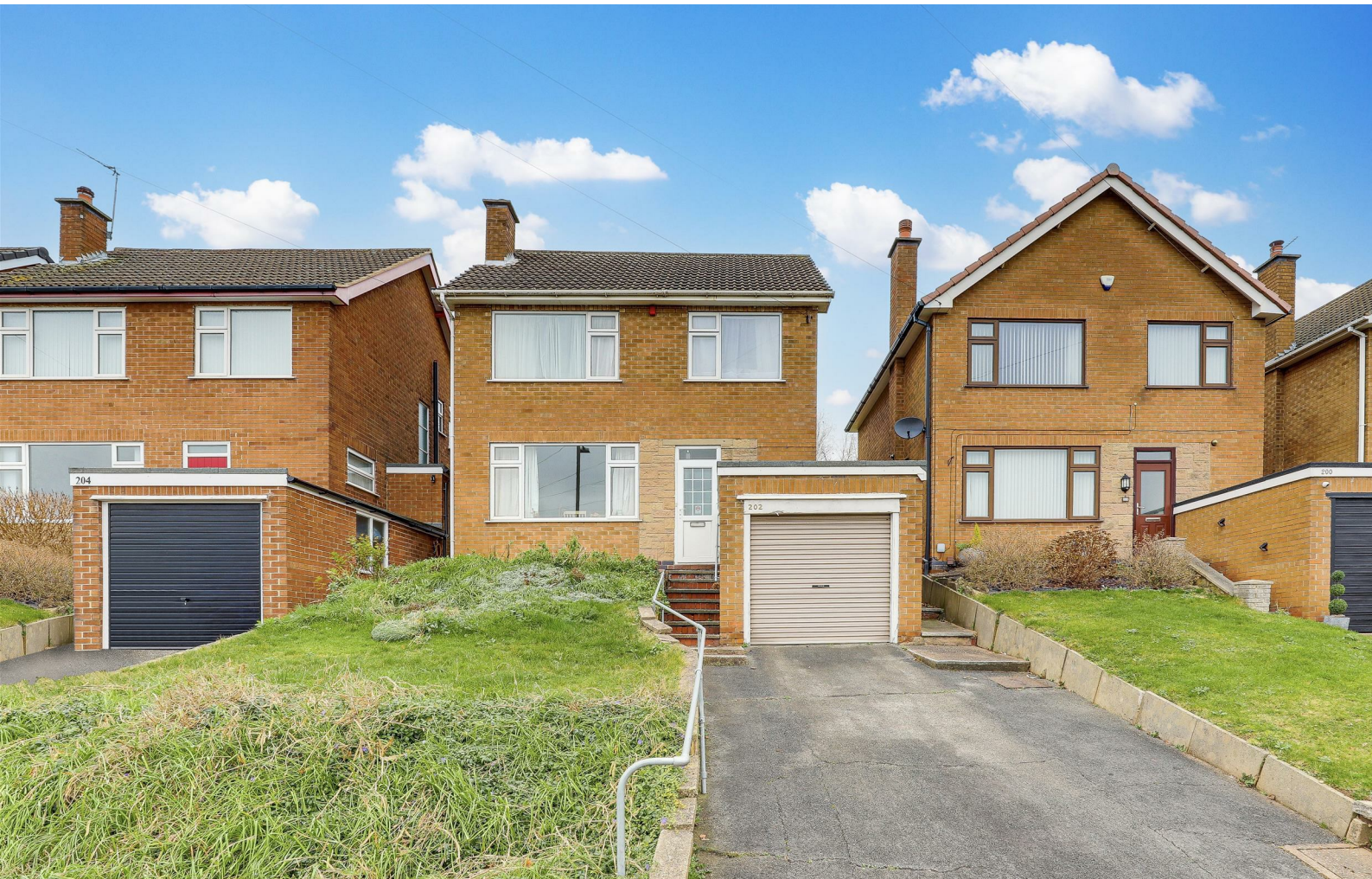
Shelford Road, Gedling, Nottinghamshire NG4 4JJ