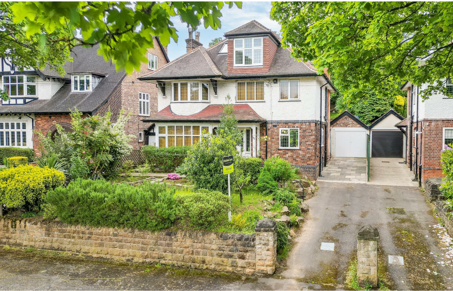
Carisbrooke Drive, Mapperley Park, Nottingham NG3 5DS