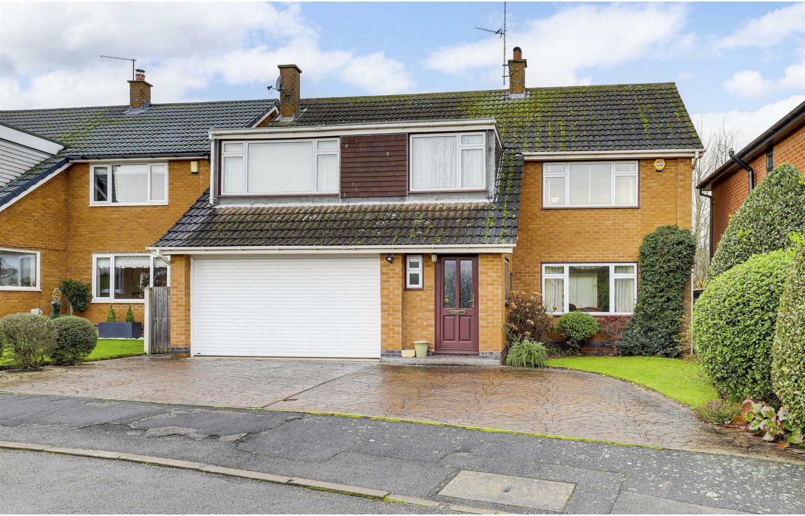
Pinfold Crescent, Woodborough, Nottinghamshire NG14 6DQ