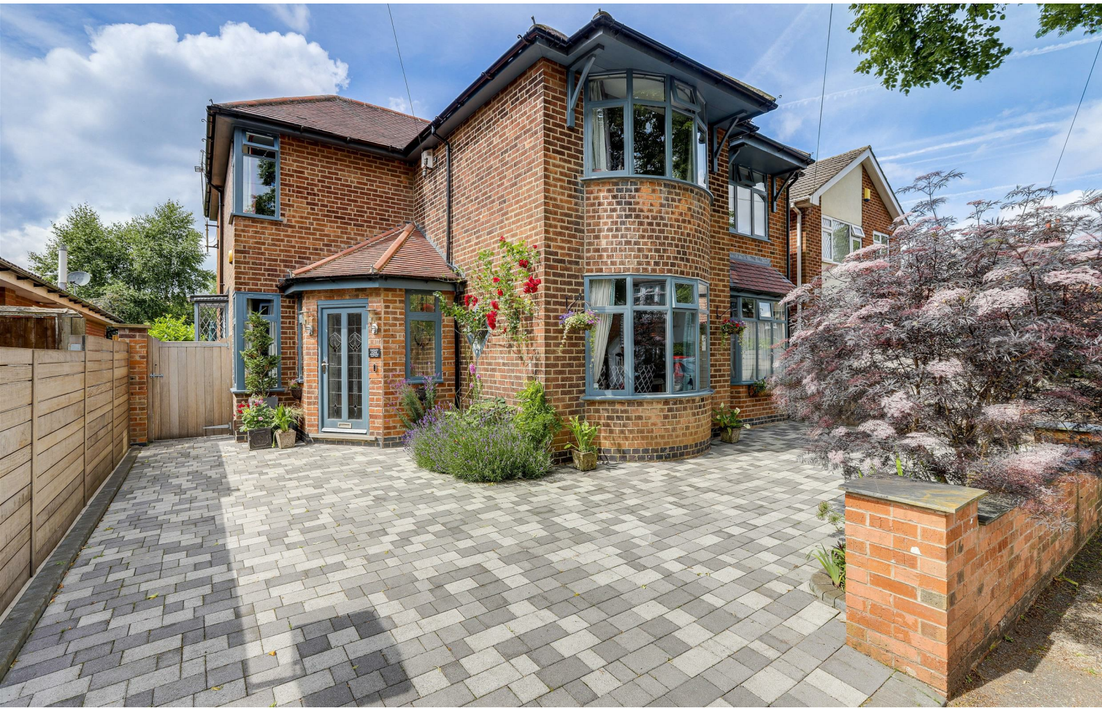
Fernleigh Avenue, Mapperley, Nottinghamshire NG3 6FL