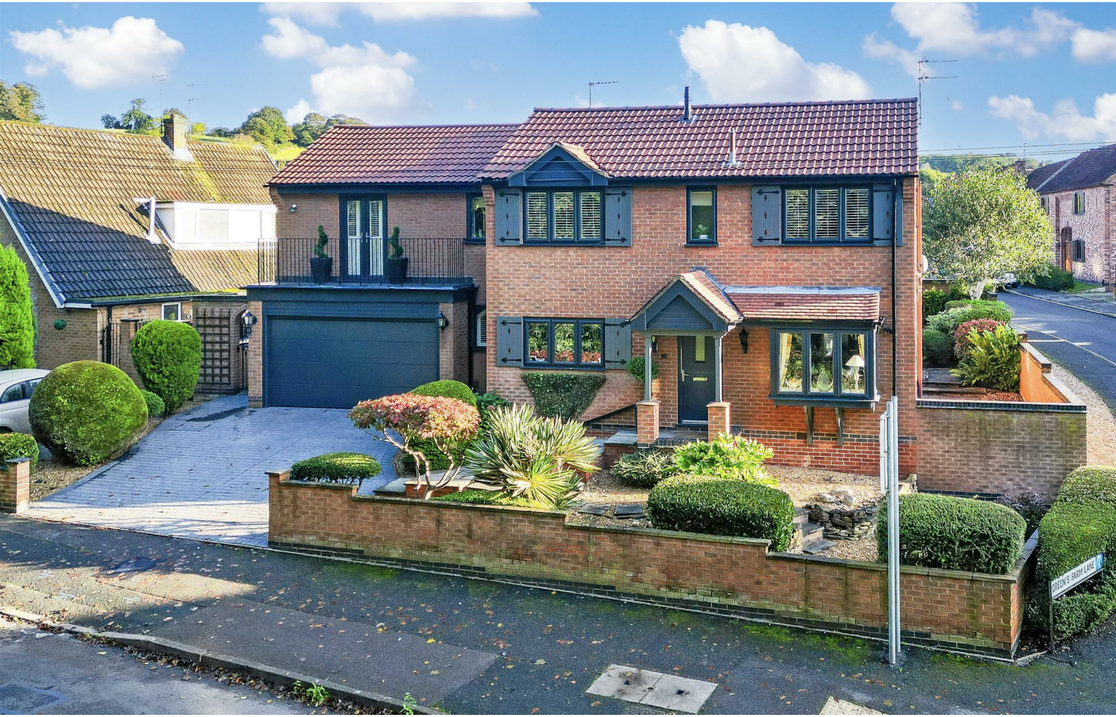
Willow Lane, Gedling, Nottinghamshire NG4 4DG