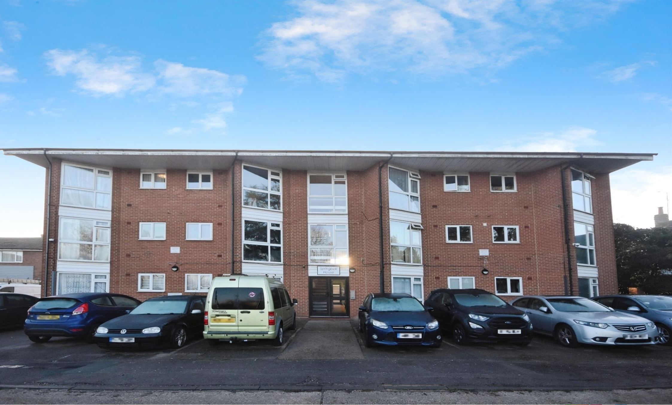
Springbok House Heycroft Way, Great Baddow Chelmsford CM2 8JH