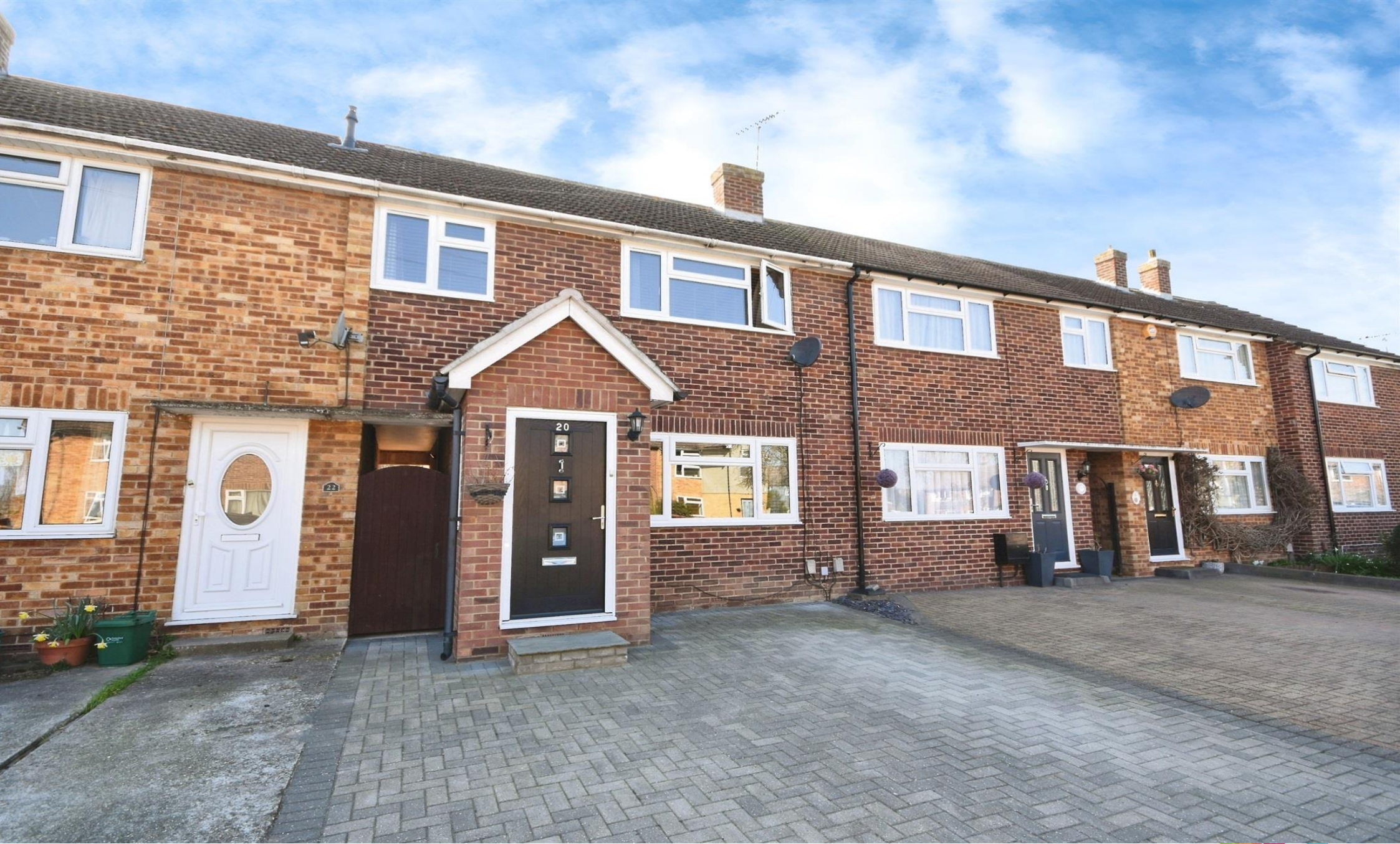
Ash Grove, Moulsham Lodge Chelmsford CM2 9JT