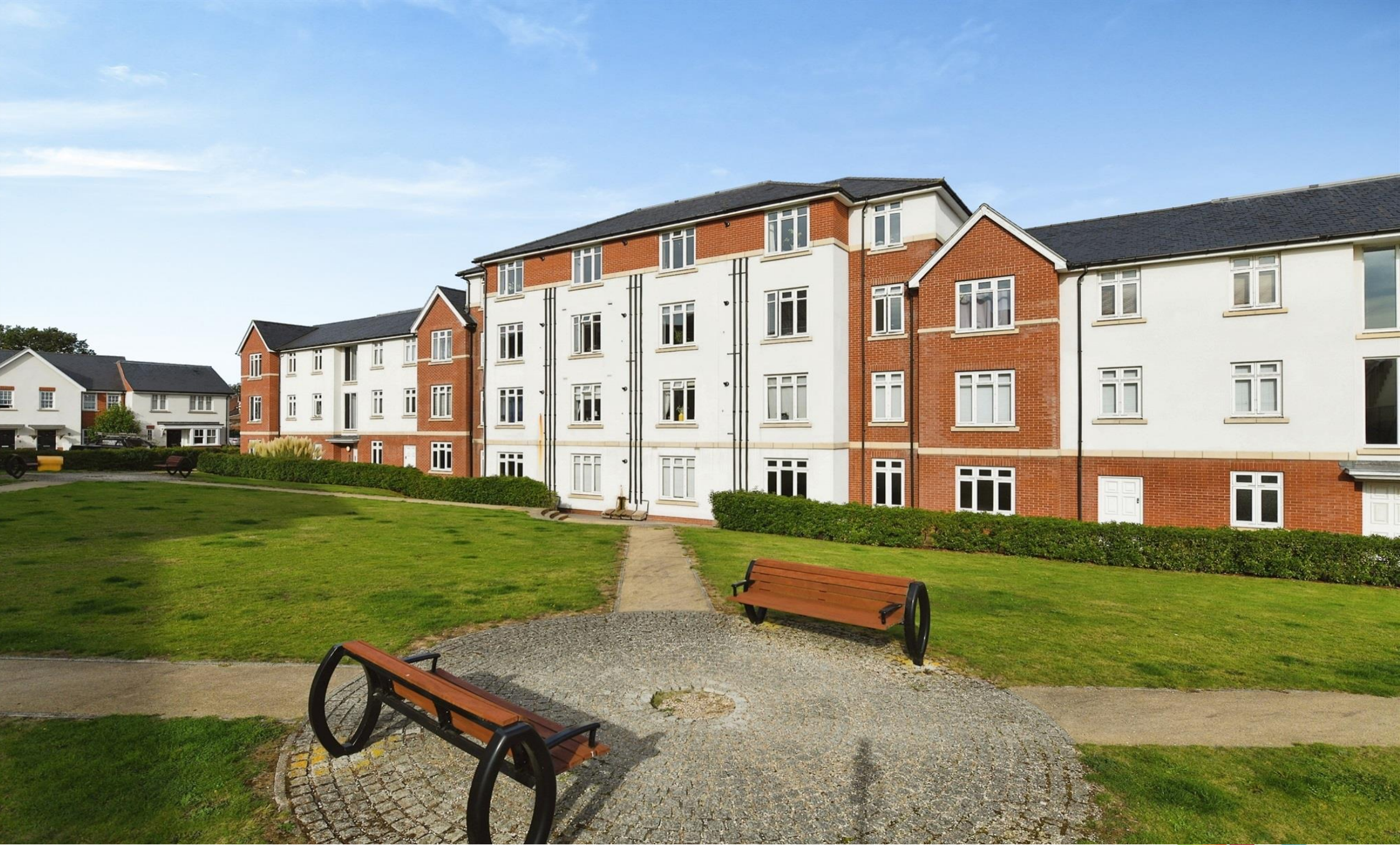
Mary Munnion Quarter, Chelmsford CM2 9FT