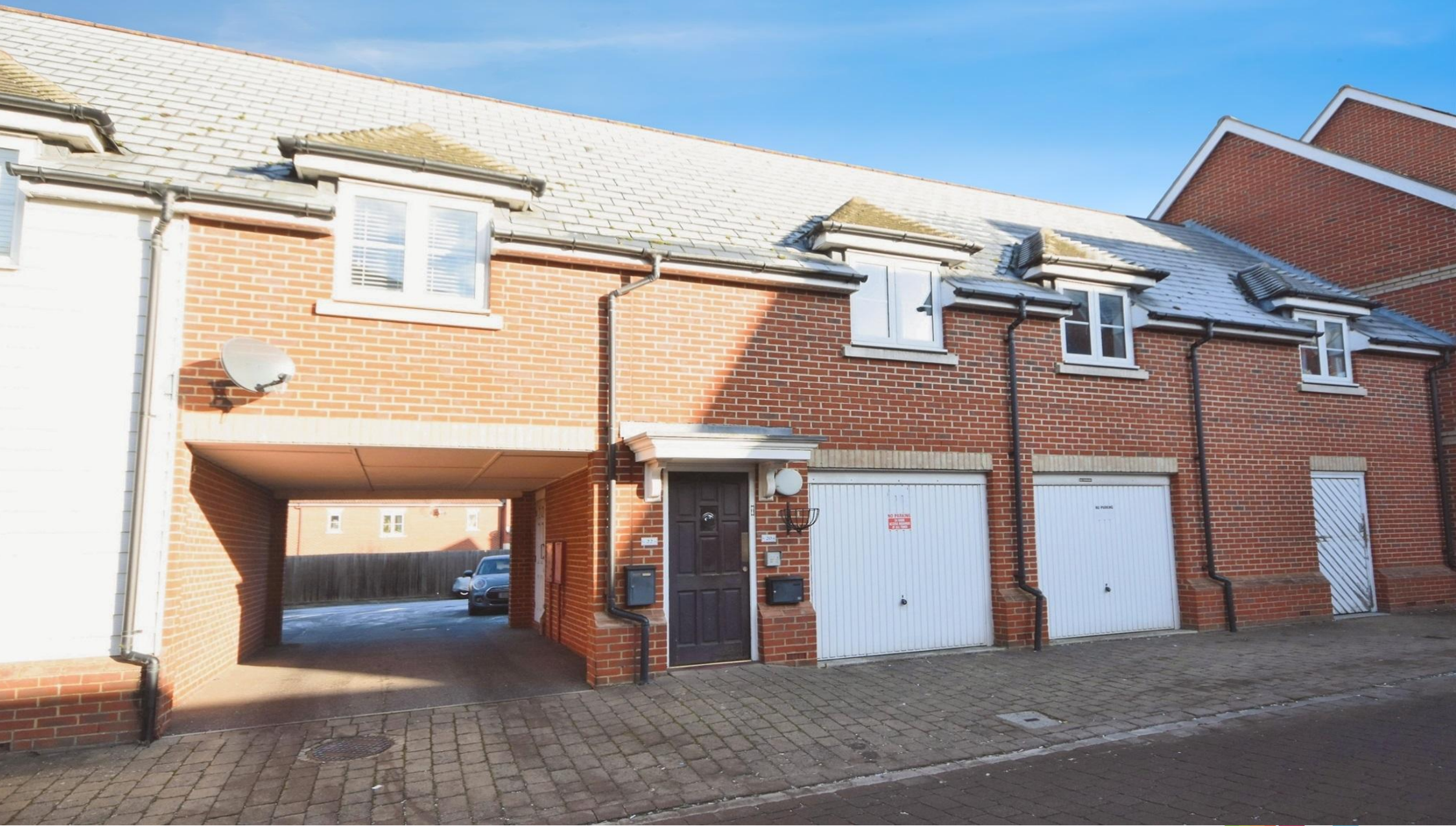
Harberd Tye, Great Baddow Chelmsford CM2 9GJ