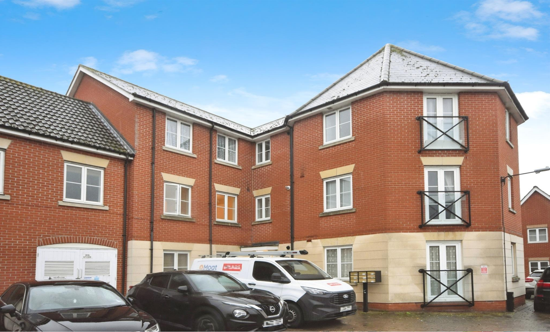
Gerard Gardens, Great Baddow CHELMSFORD CM2 9GD