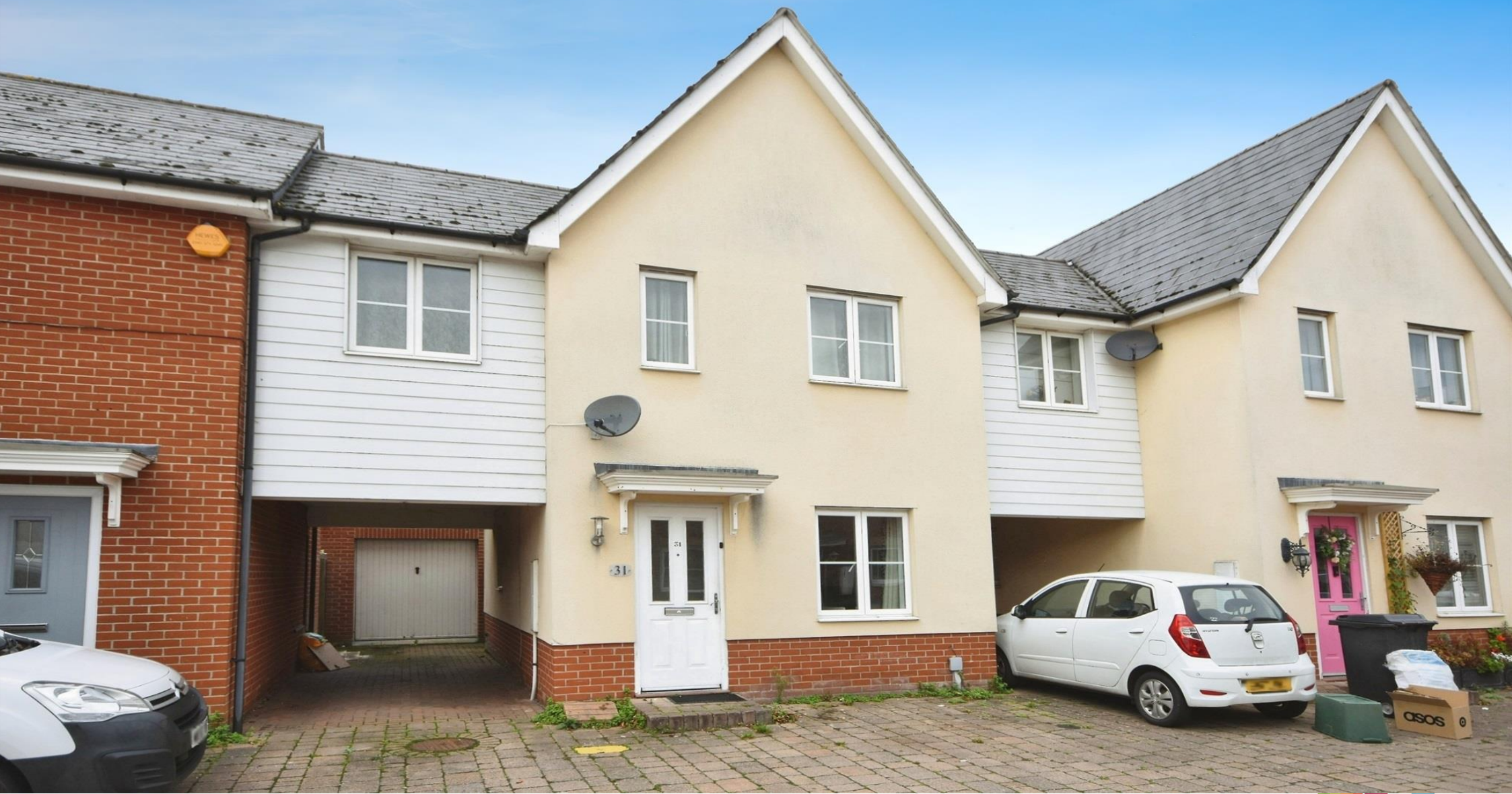
Gerard Gardens, Great Baddow CHELMSFORD CM2 9GD