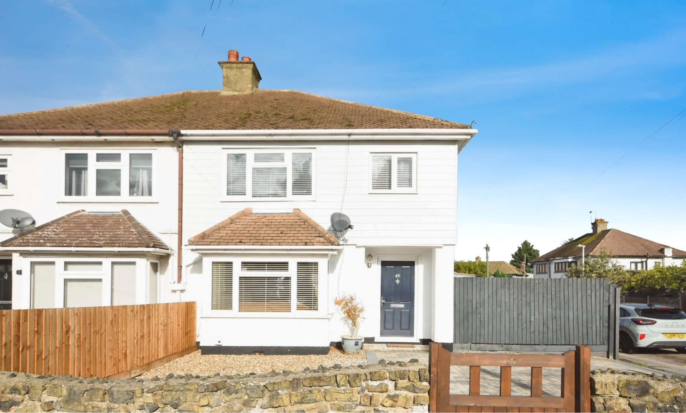
Loftin Way, Moulsham Lodge Chelmsford CM2 9TR