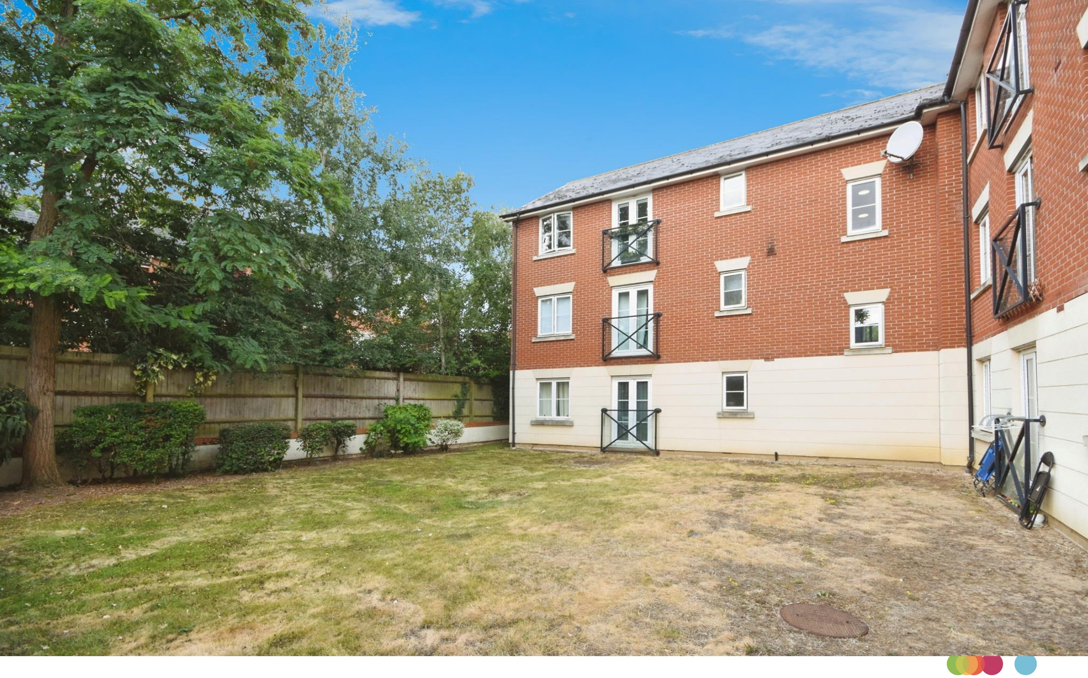
Gerard Gardens, Great Baddow Chelmsford CM2 9GD