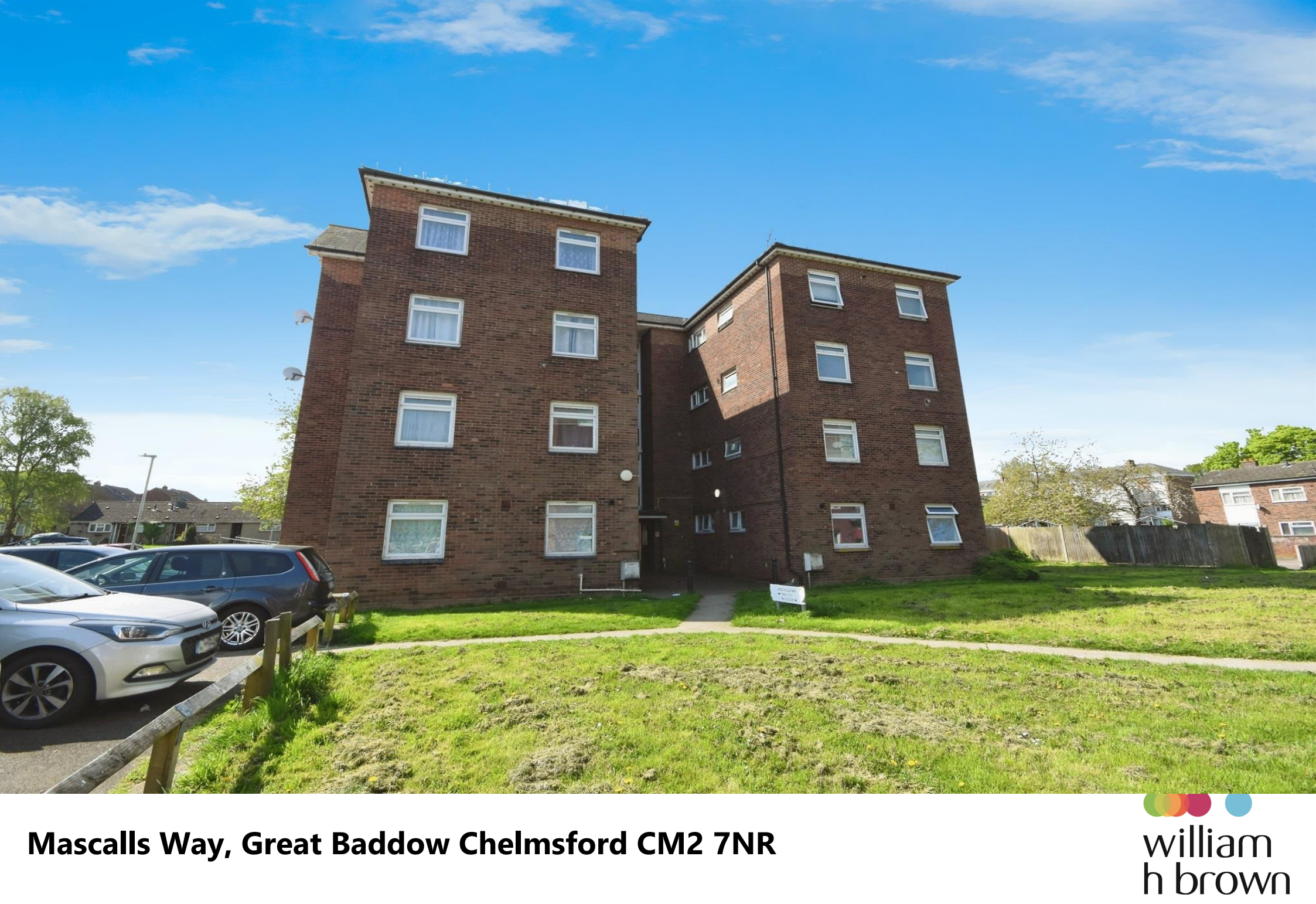
Mascalls Way, Great Baddow Chelmsford CM2 7NR