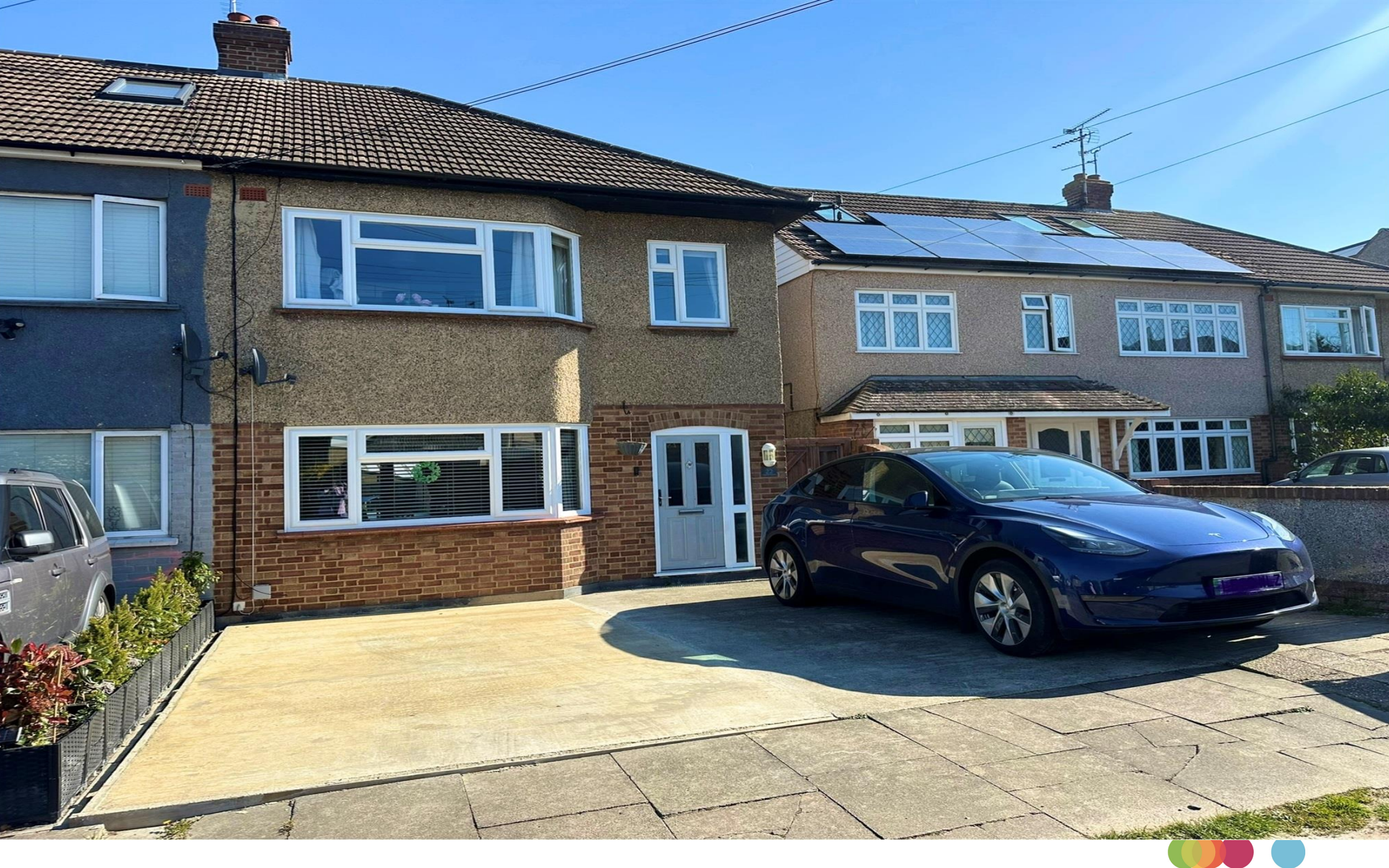
Langdale Gardens, Chelmsford CM2 9QH