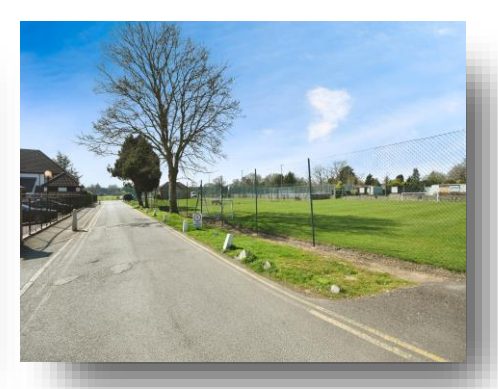
Baddow Rd Baddow Rd Baddow Rd Map data ©2025