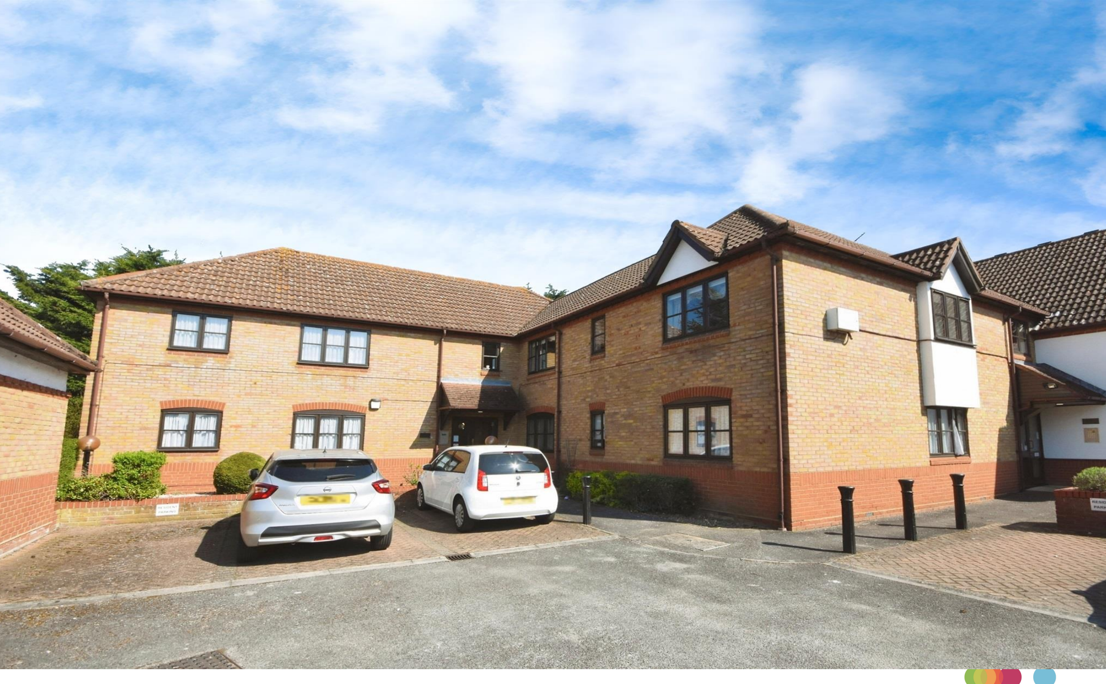
Roberts Court Baddow Road, Great Baddow Chelmsford CM2 9RQ