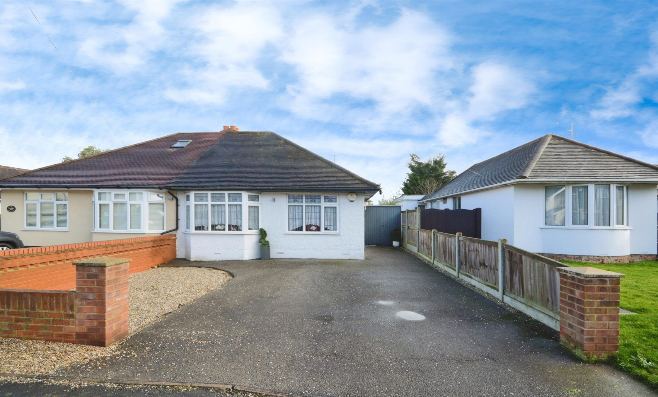
Baddow Hall Crescent, Great Baddow Chelmsford CM2 7BY