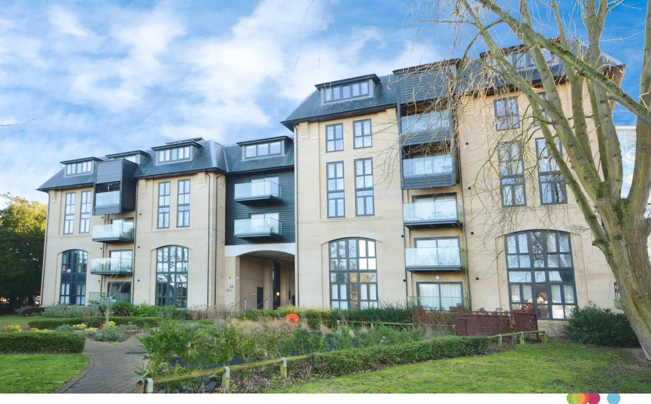
Armstrong Gibbs Court The Causeway, Great Baddow Chelmsford CM2 7FR