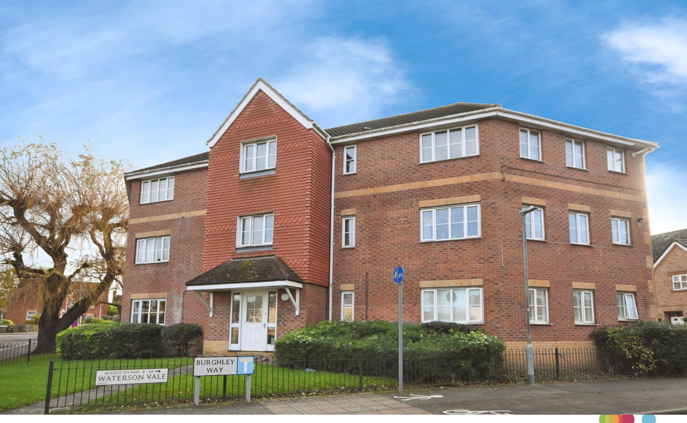
Waterson Vale, Moulsham Lodge Chelmsford CM2 9PB