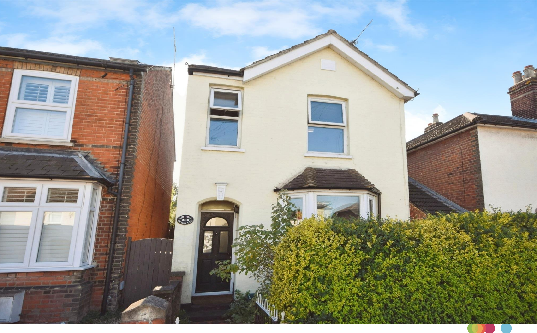
Baddow Road, Great Baddow Chelmsford CM2 9QX