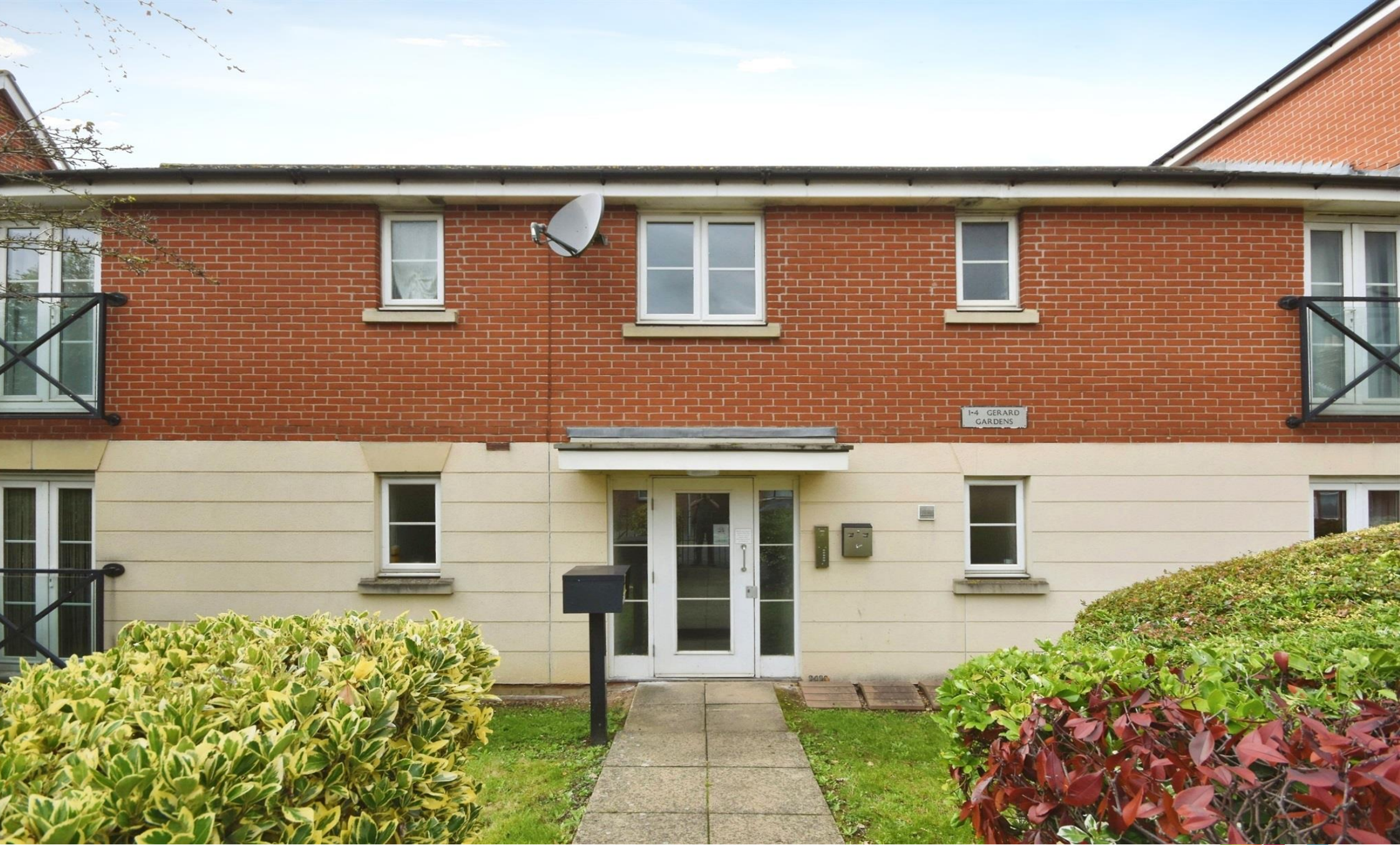
Gerard Gardens, Great Baddow Chelmsford CM2 9GD