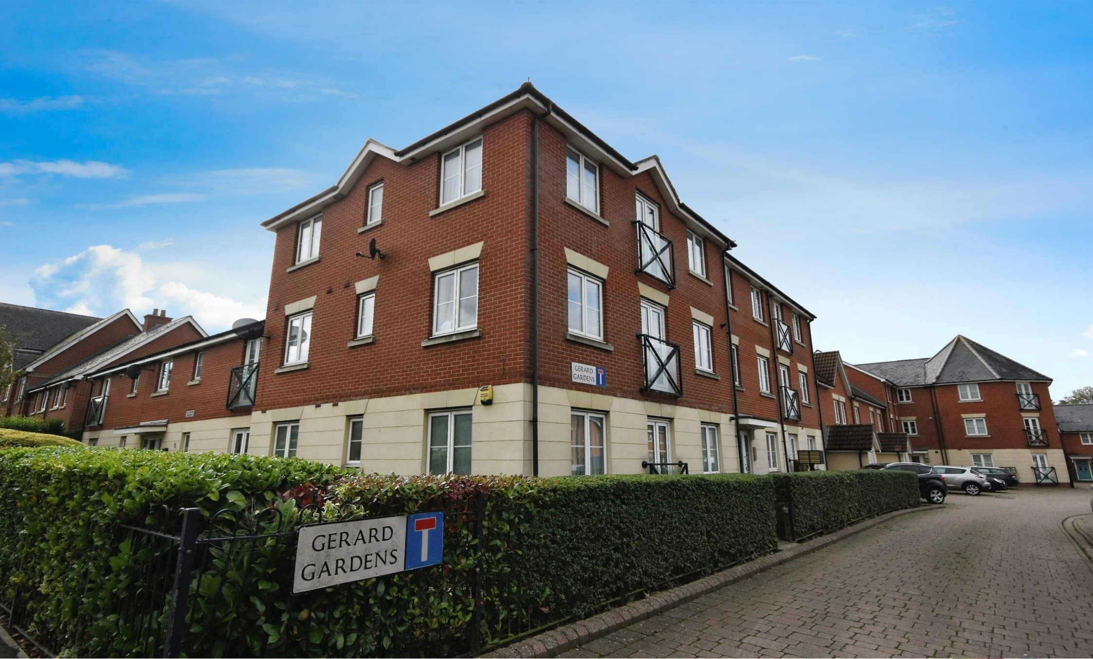
Gerard Gardens, Chelmsford CM2 9GD