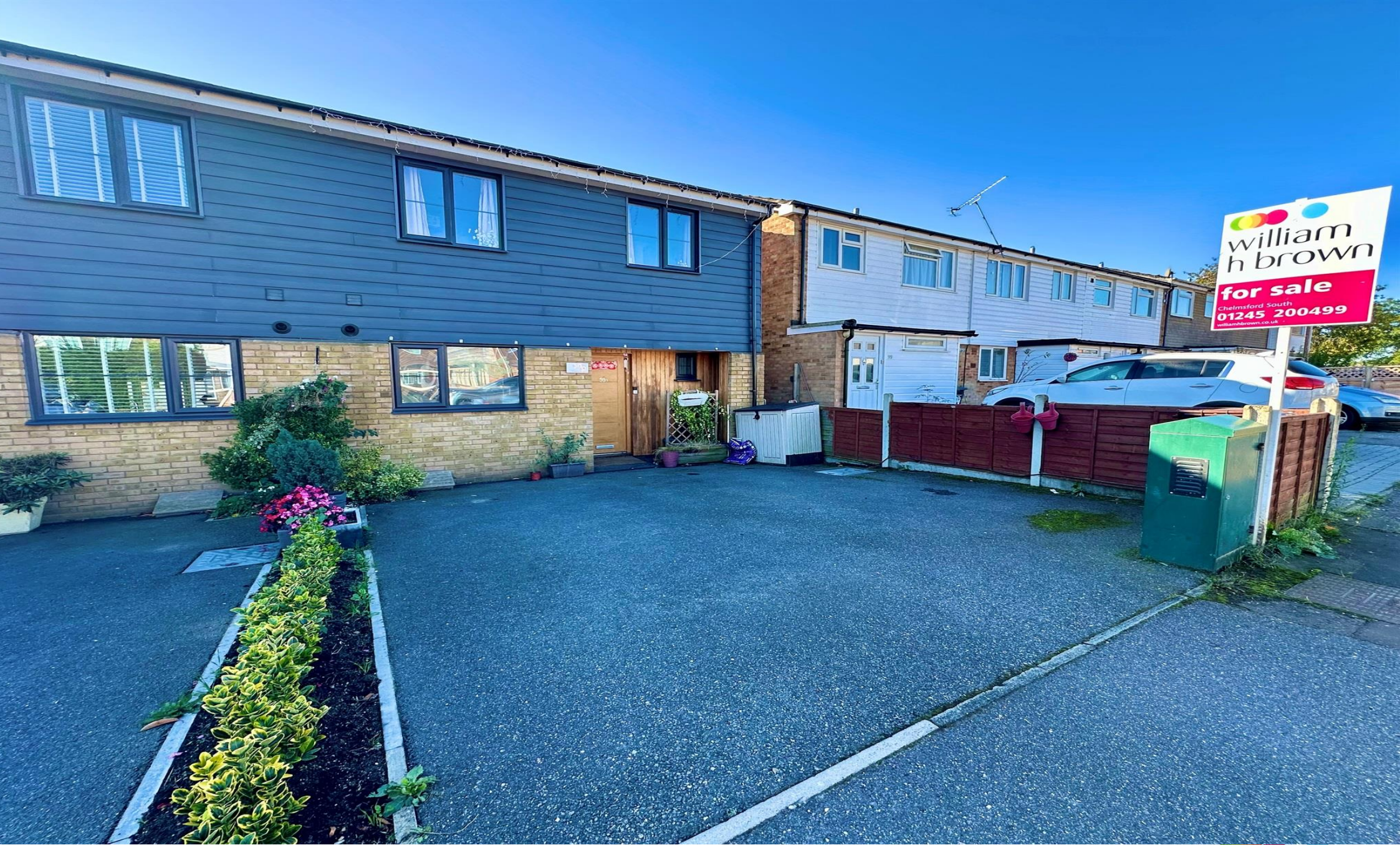
Noakes Avenue, Great Baddow Chelmsford CM2 8EW