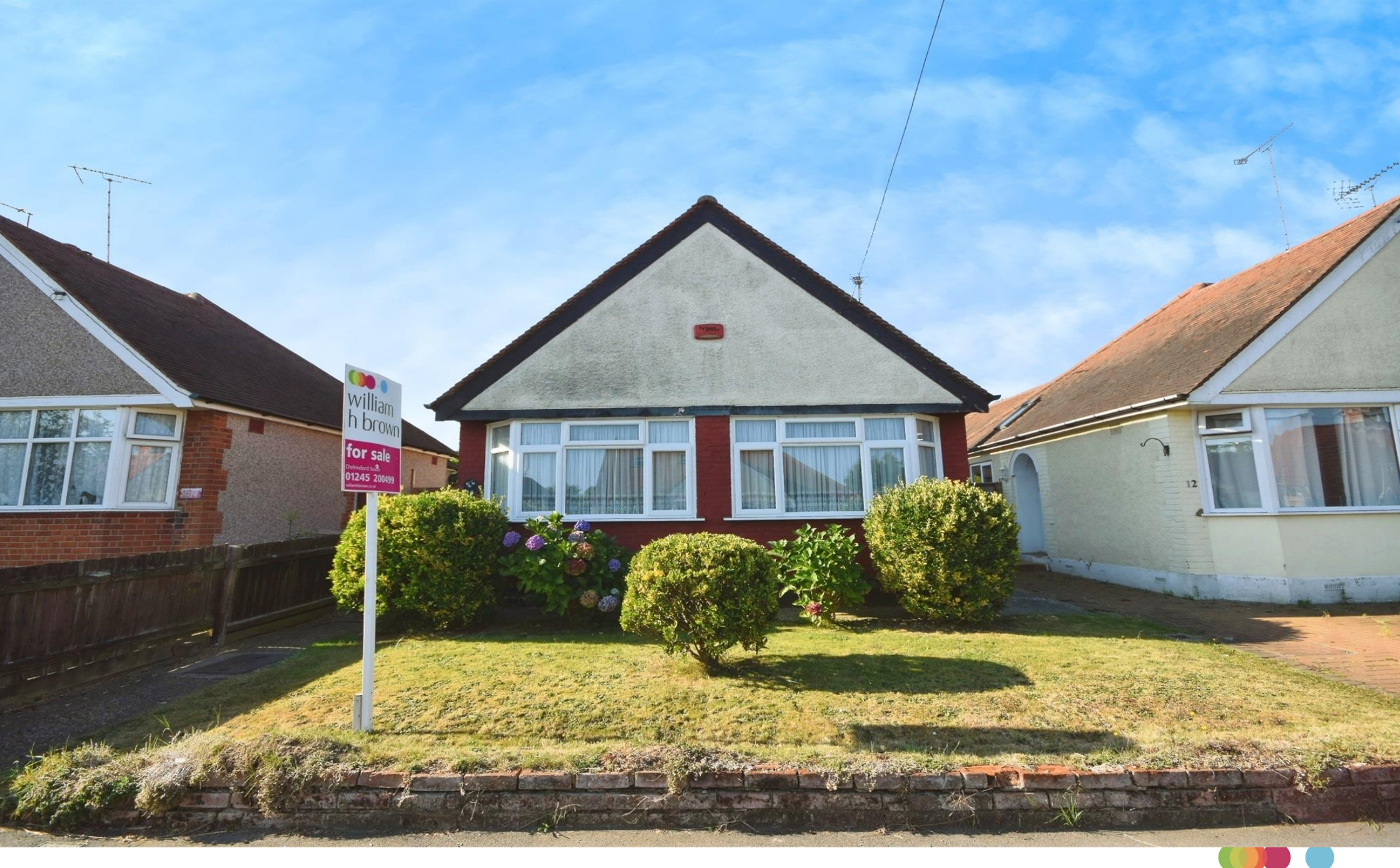
Wallace Crescent, Chelmsford CM2 9QL