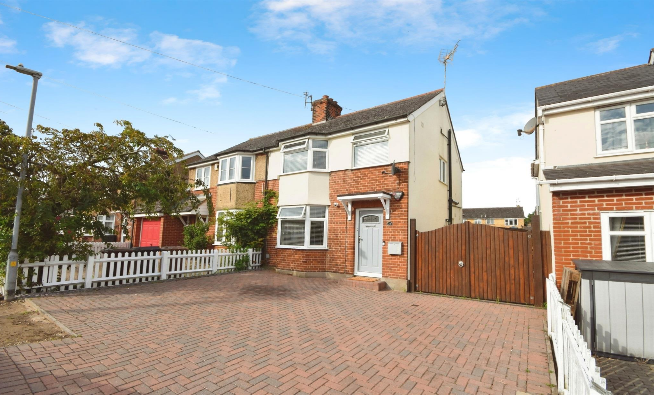
Baddow Hall Crescent, Great Baddow CHELMSFORD CM2 7BY