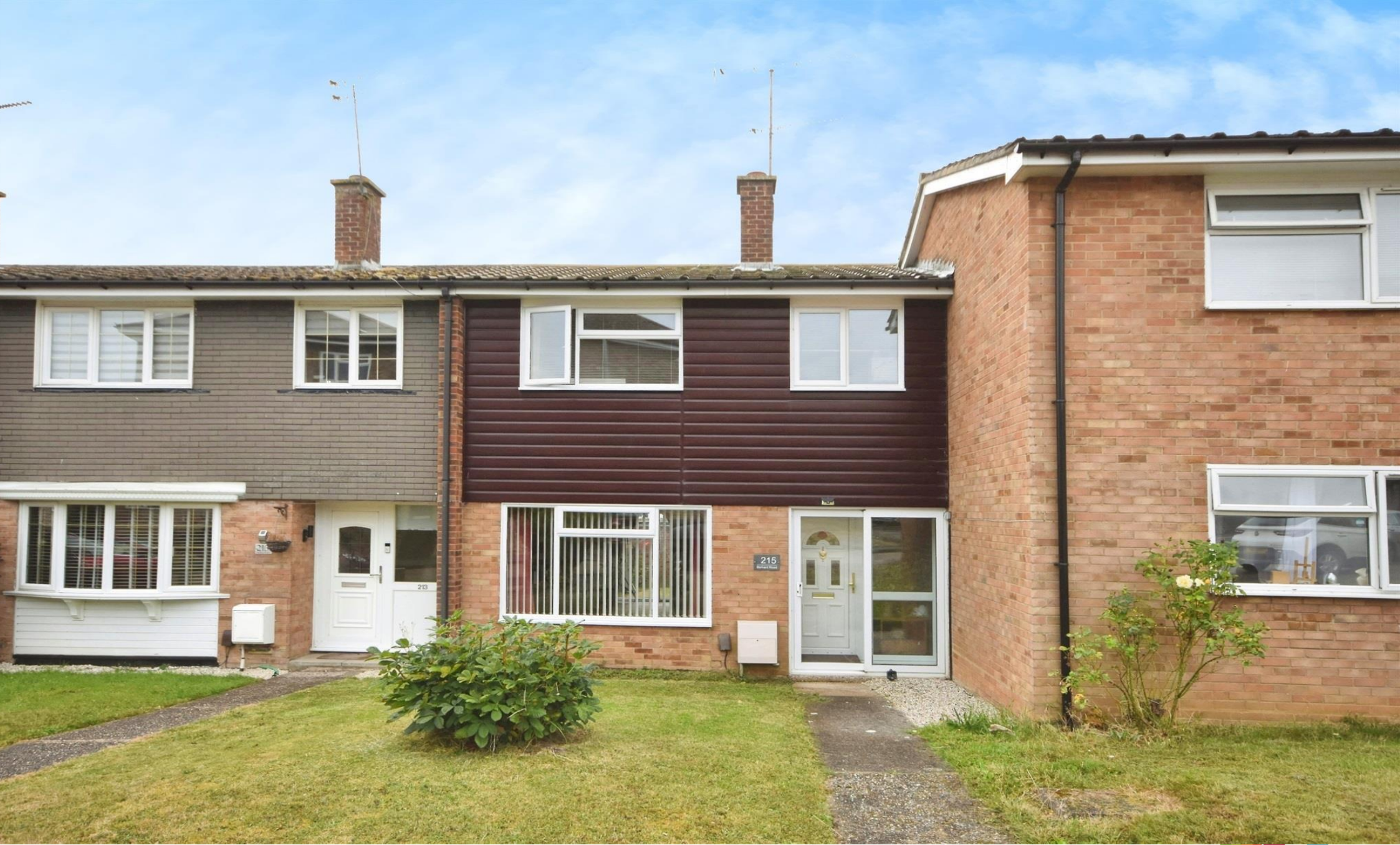
Barnard Road, Chelmsford CM2 8RT