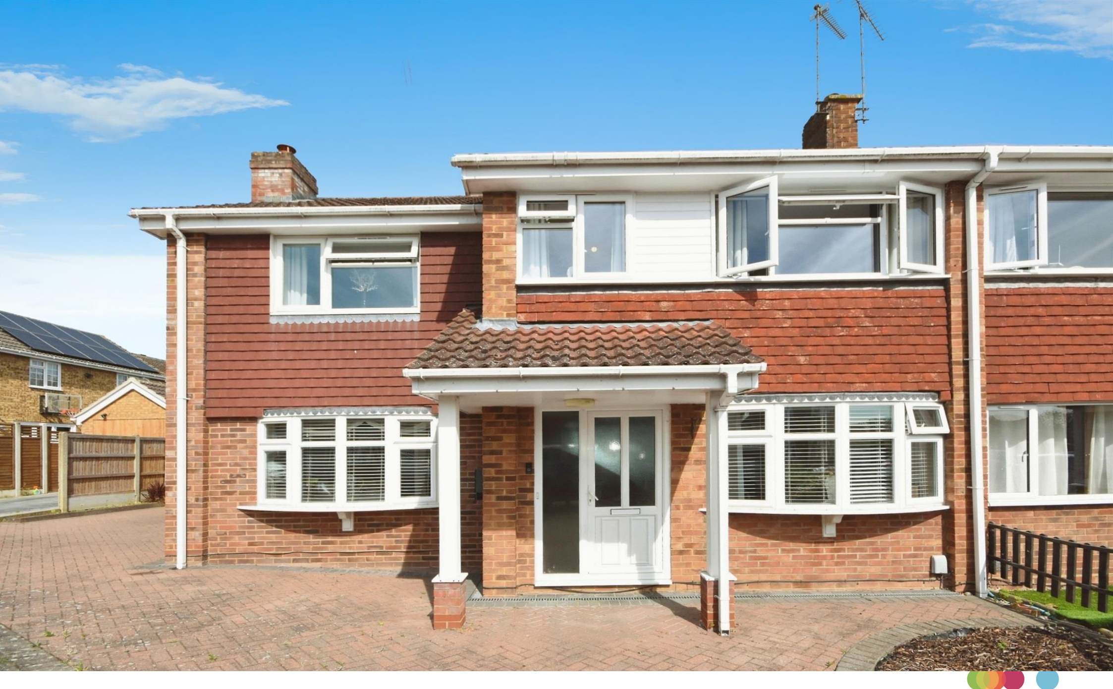
Cannon Leys, Galleywood Chelmsford CM2 8PD