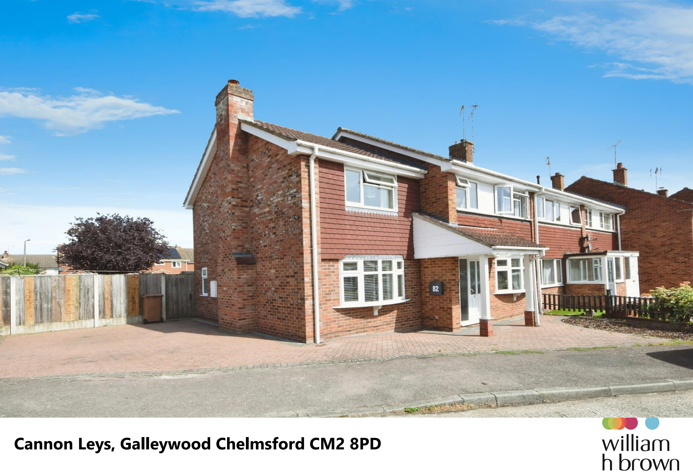
Cannon Leys, Galleywood Chelmsford CM2 8PD