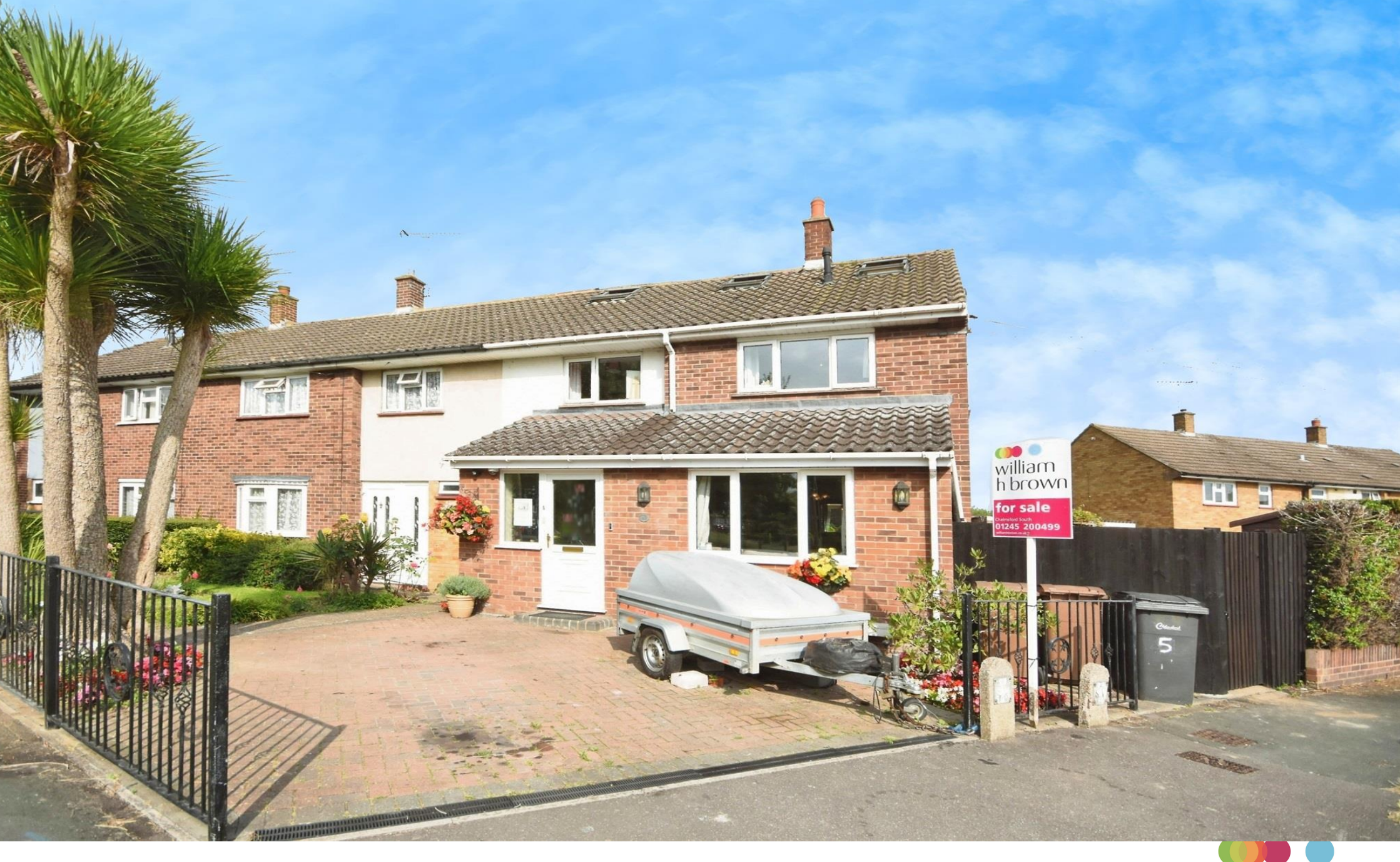
Meadgate Avenue, Great Baddow Chelmsford CM2 7ND