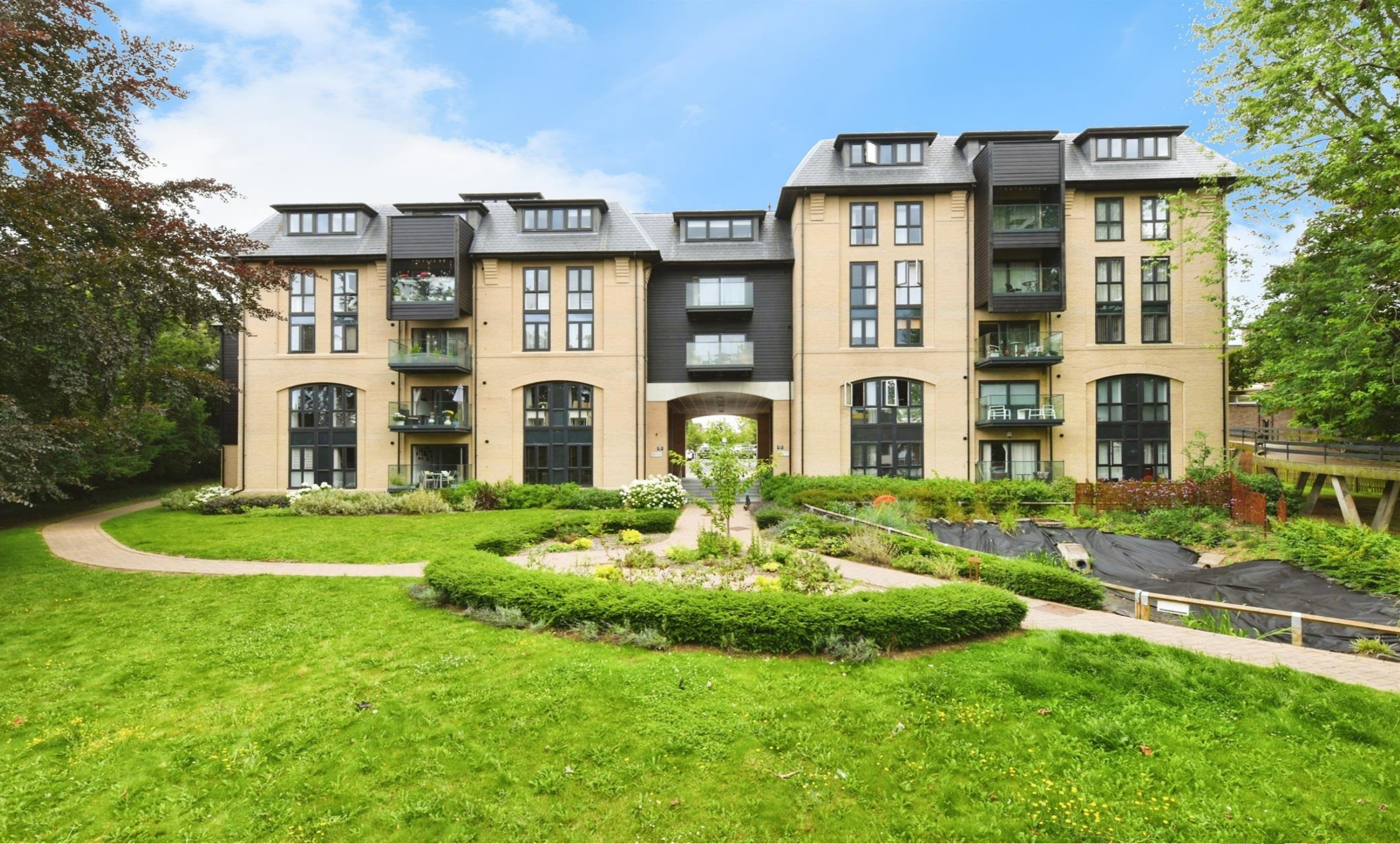
Armstrong Gibbs Court The Causeway, Great Baddow Chelmsford CM2 7FR