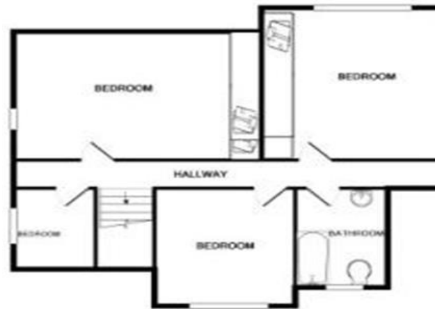
FIRST FLOOR APPROX. FLOOR AREA 807 SQ. FT. (75.0 SQ. M.) TOTAL APPROX. FLOOR AREA 2619 SQ. FT. (241.3 SQ. M.) We have made every effort to ensure the accuracy of the floor plan contained here. Measurements, finishes, areas, rooms and any other items are approximate and no responsibility is taken for any error, omission, or misstatement. This plan is for illustrative purposes only and should be used as such by any prospective purchaser. The services, systems and appliances shown here are not tested and no guarantee as to their operation or efficiency can be given. Made with Makroplan 02011