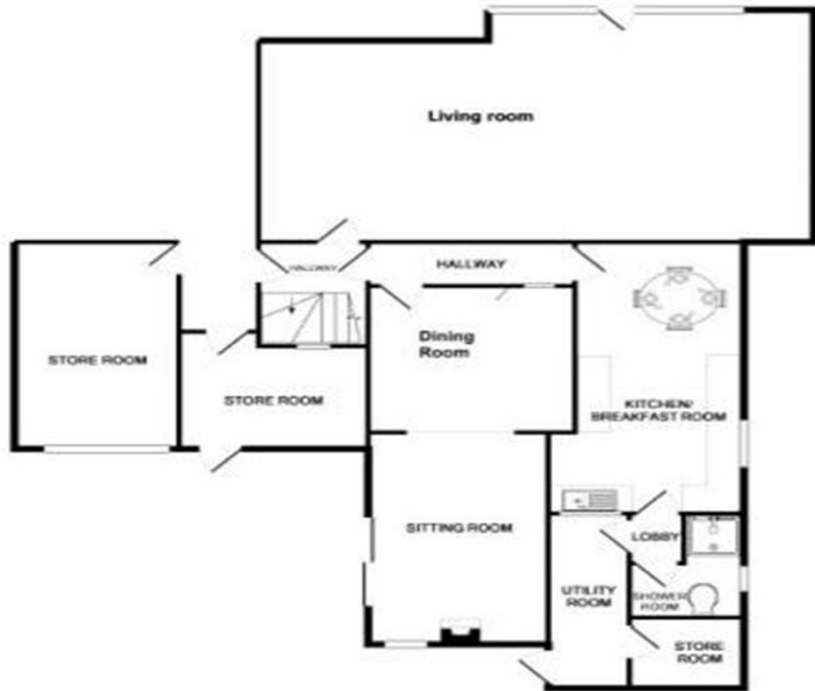
GROUND FLOOR APPROX. FLOOR AREA 1812 SQ. FT. (166.3 SQ. M.)