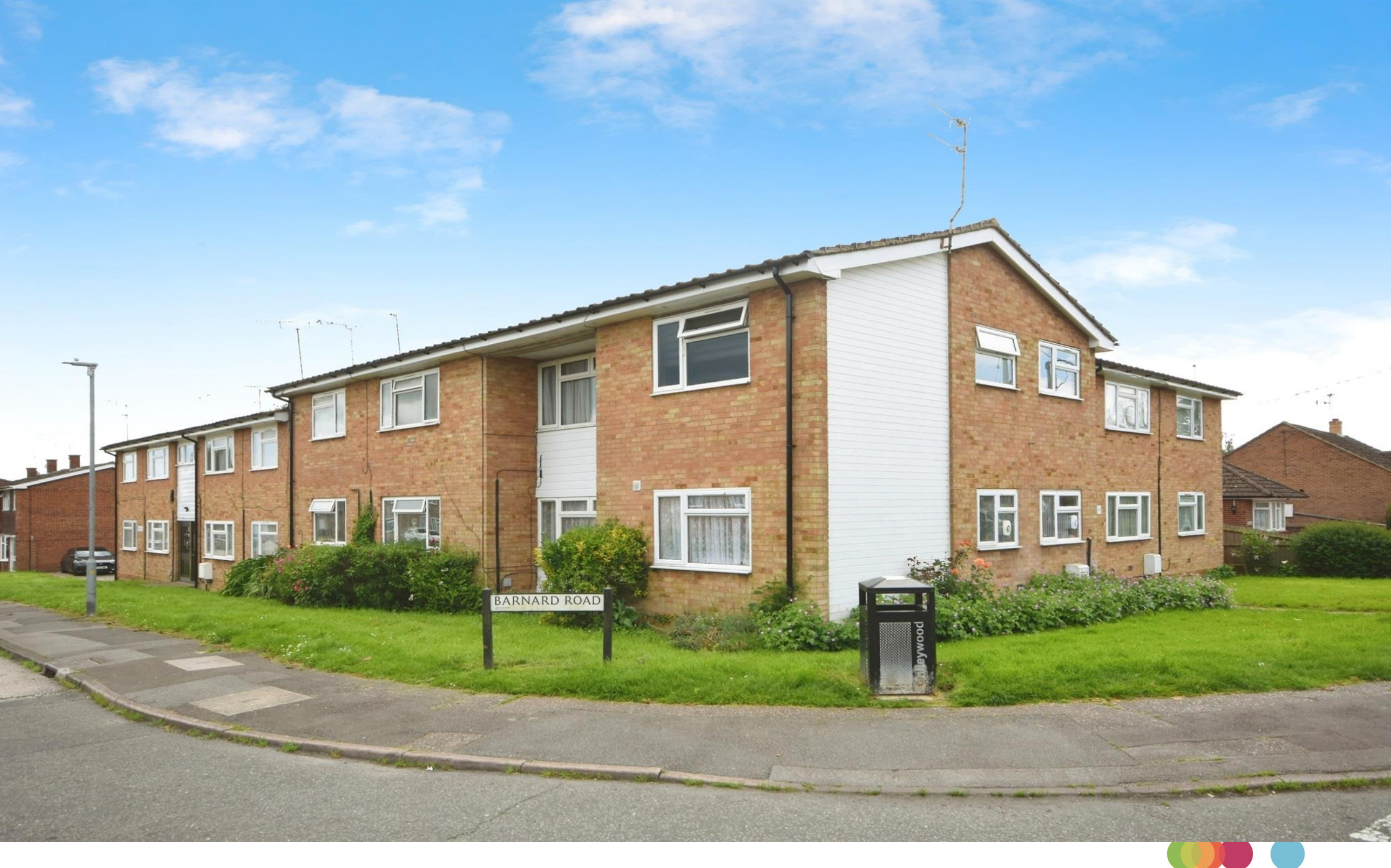
Barnard Road, Galleywood Chelmsford CM2 8RU