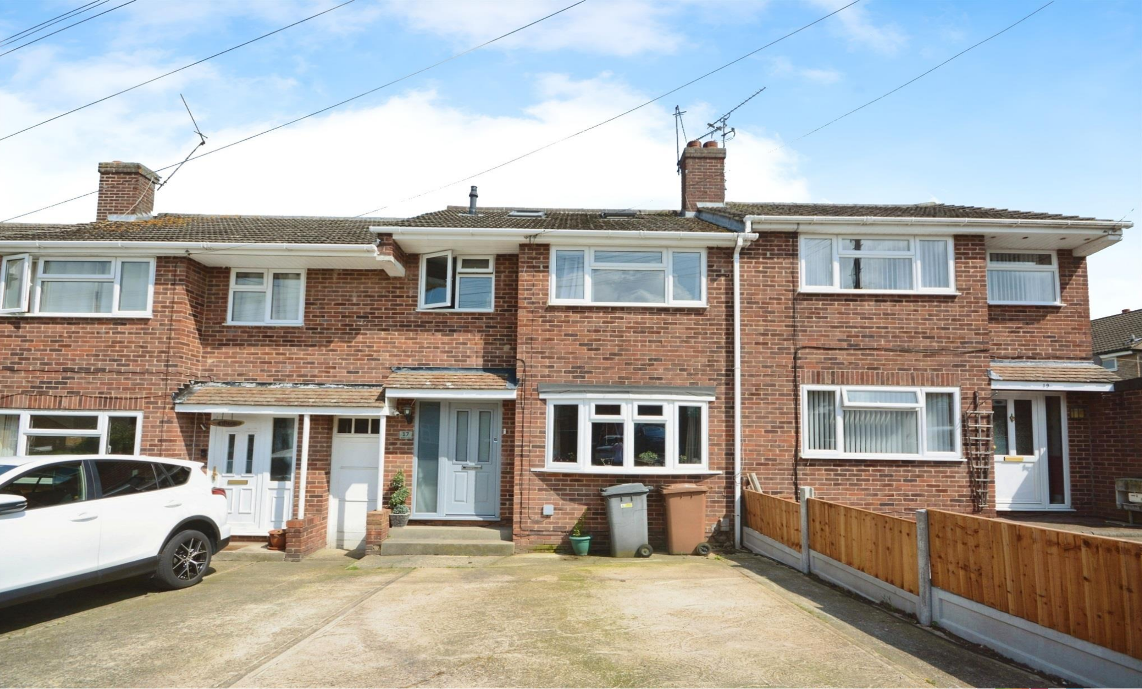
Hawthorn Close, Chelmsford CM2 9NW