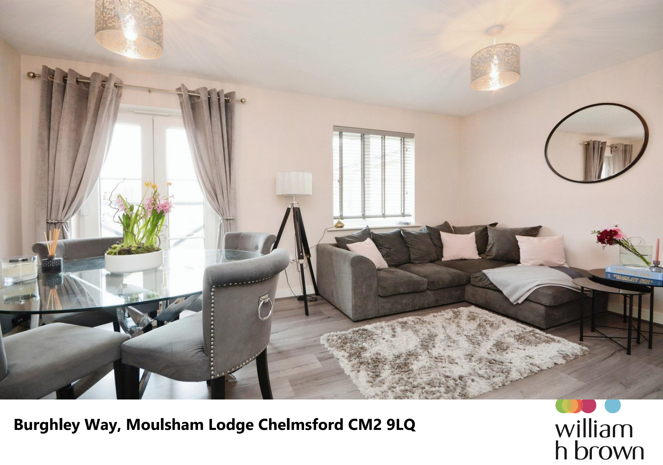
Burghley Way, Moulsham Lodge Chelmsford CM2 9LQ