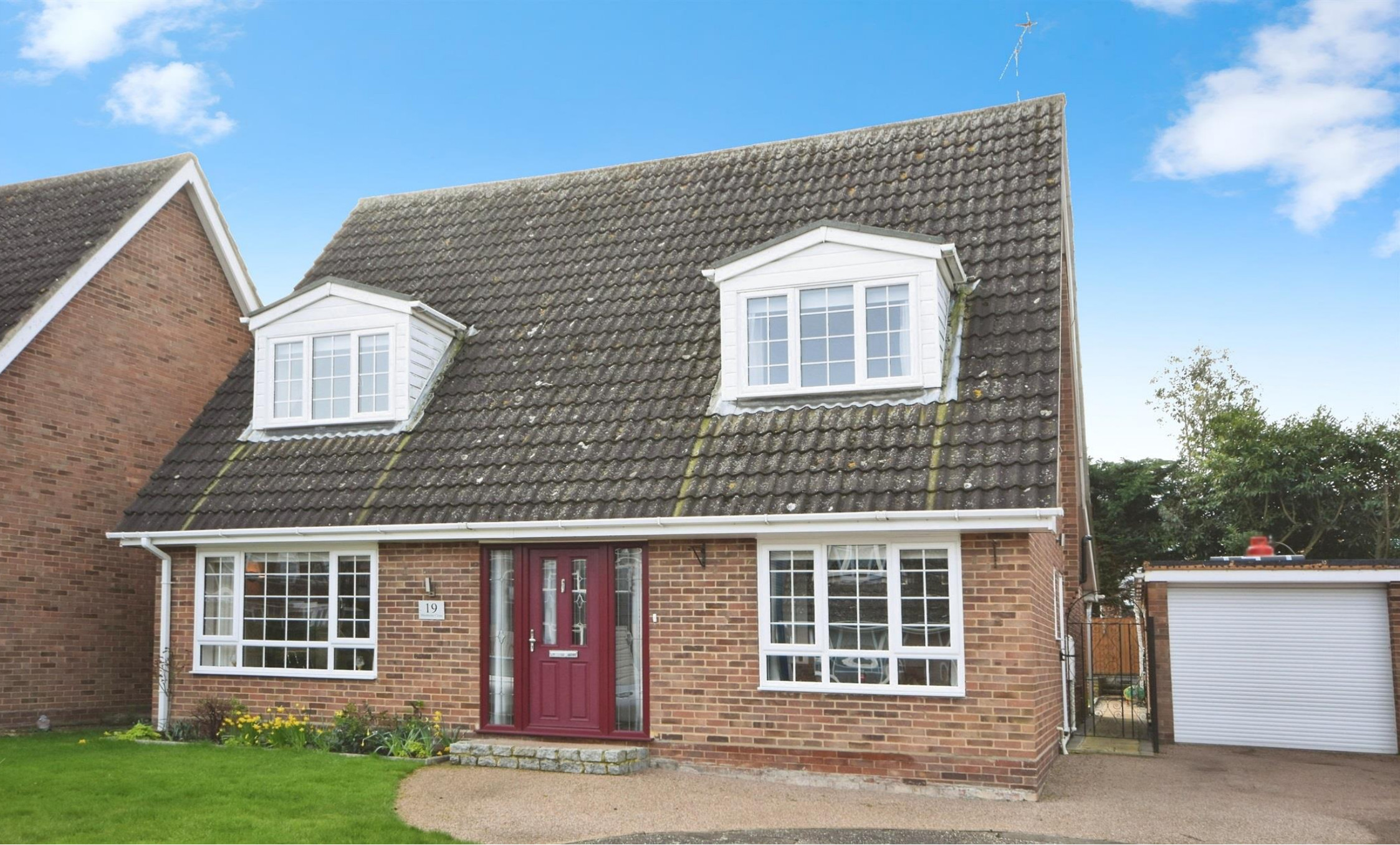
Blenheim Close, Danbury Chelmsford CM3 4NE