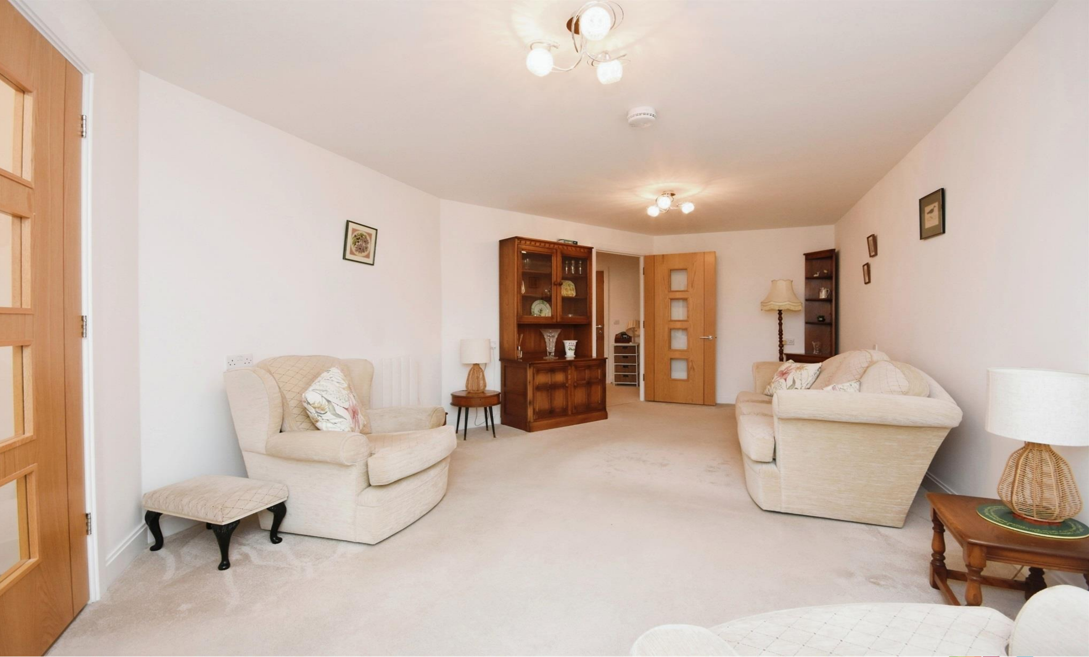
Miami House Princes Road, Chelmsford CM2 9GE