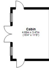
Ground Floor Approx. 111.7 sq. metres (1202.3 sq. feet)

Local Authority Wiltshire Council Tax Band E EPC Rating D