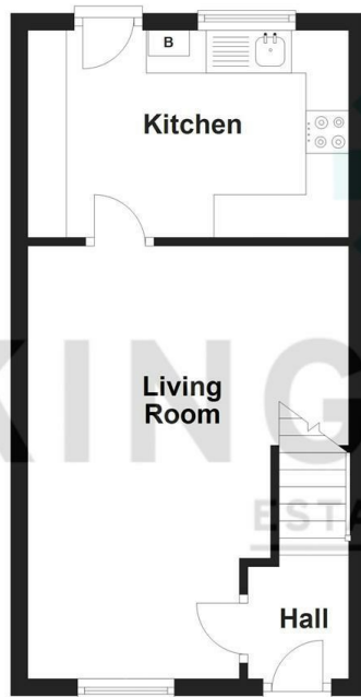
Ground Floor Approx. 27.4 sq. metres (294.7 sq. feet)