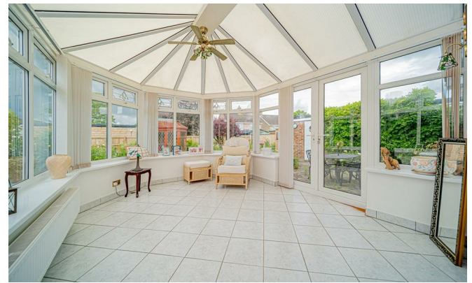
Birch Grove Bowerhill, Melksham SN12 6SB