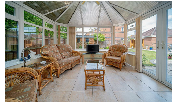
Burnet Close , Melksham SN12 7SJ