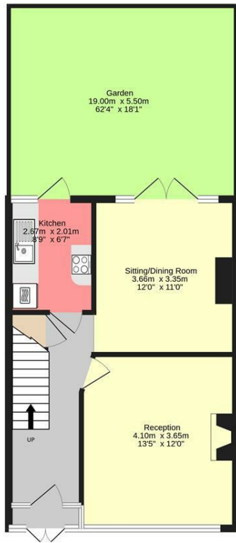
GROUND FLOOR 40.6 sq.m. (437 sq.ft.) approx.