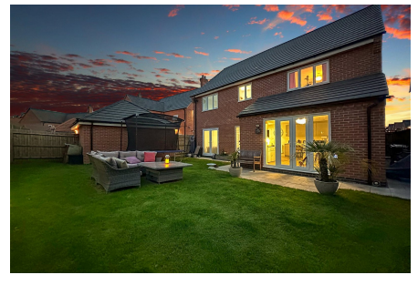
WHAT A PROPERTY! | Private Cul-De-Sac Location | 4 Large Bedrooms With Master En-Suite | Private Rear Garden | Stunning Open Plan Kitchen With Utility Room | This Property Should Not Be Missed!