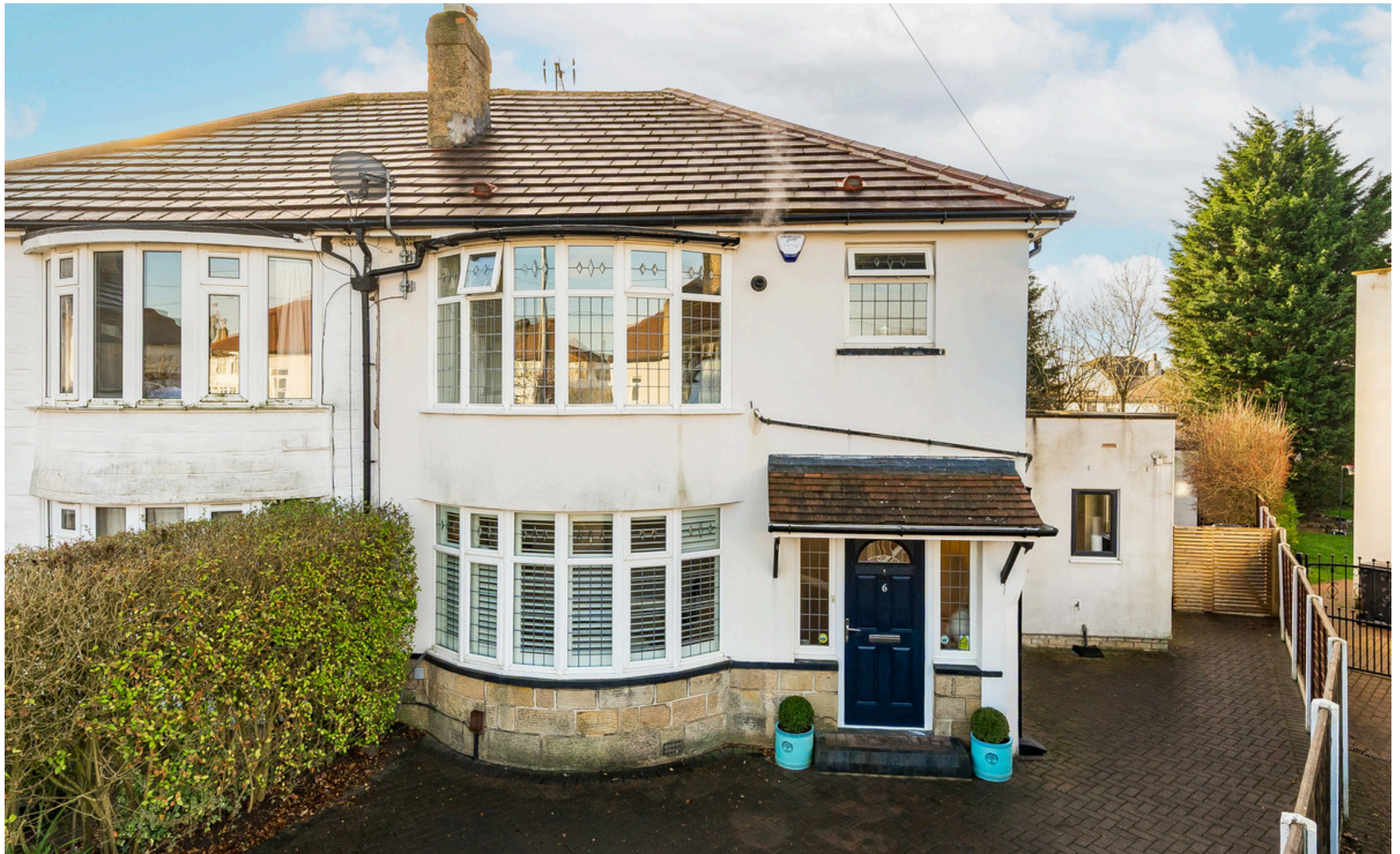
6 The Willows, Moortown, LS17 6LB