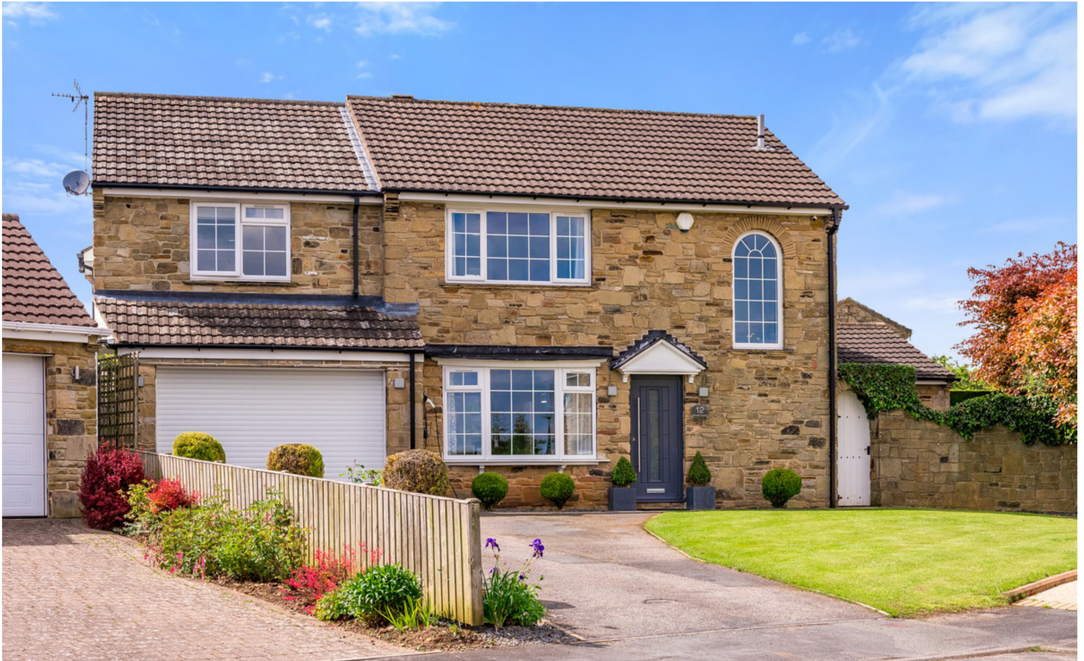
12 Ambleside Walk, Wetherby, LS22 6DP